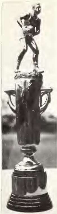
Trophy received by the Haw River Boys' Basketball Team as winners of the Alamance County Basketball Tournament.