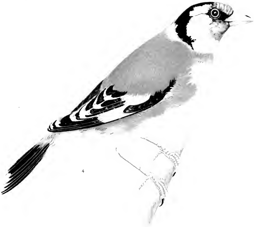
FIG. 3. HYBRID BETWEEN GOLDFINCH (FIG. 4) AND CRESTED YELLOW CANARY. TYPE OF FIG. 2 (NO. 203.-)