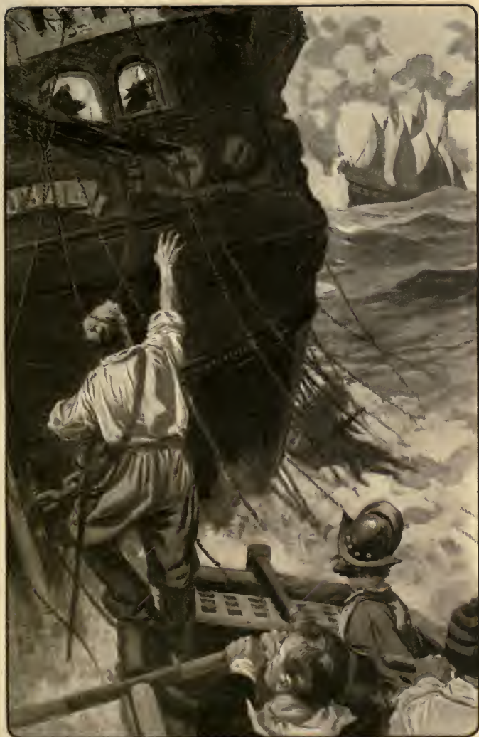
"Α ΜΟΙ! Α ΜΟΙ!"—Page 24.