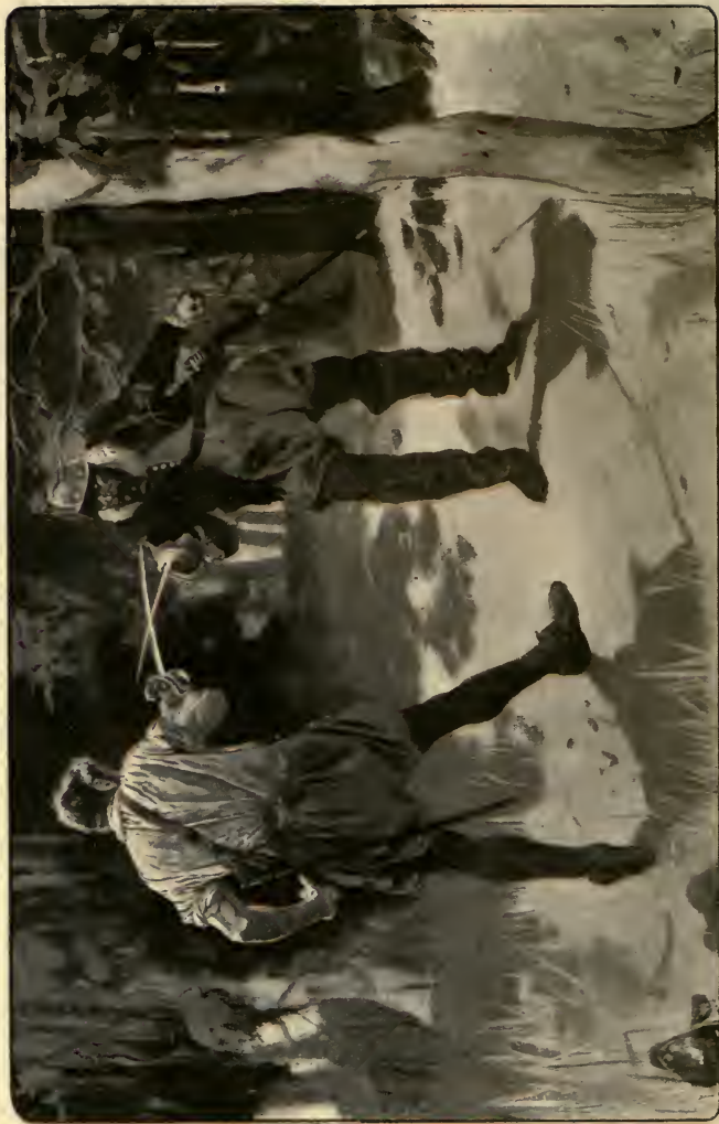
"QUICK AS HE WAS, MY HAND WAS EVER QUICKER."—Page 357.