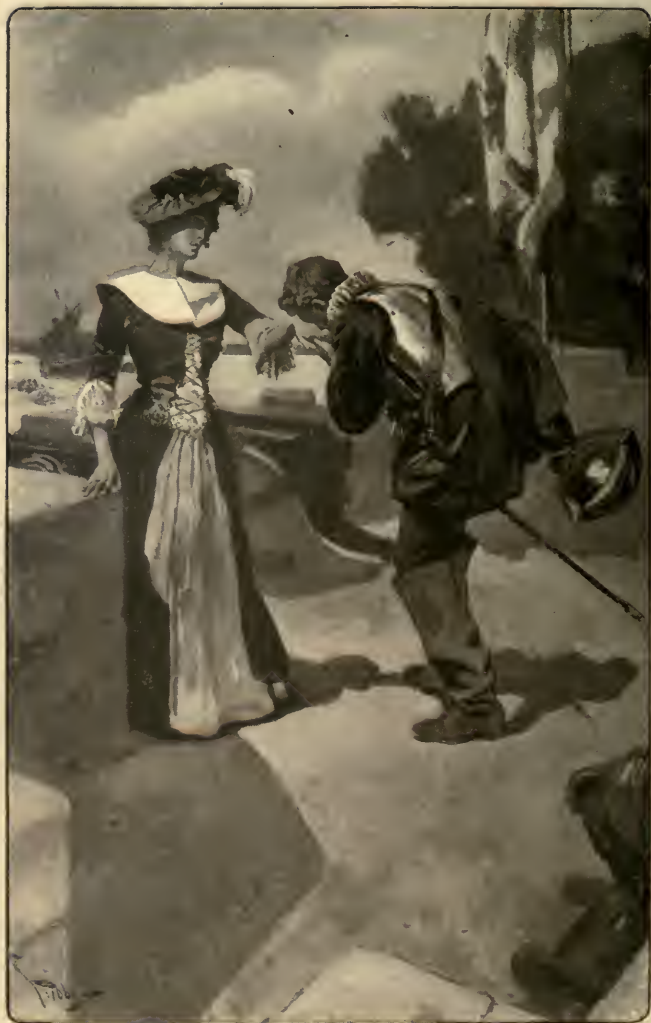
"THEN I LEFT HER."—Page 115.