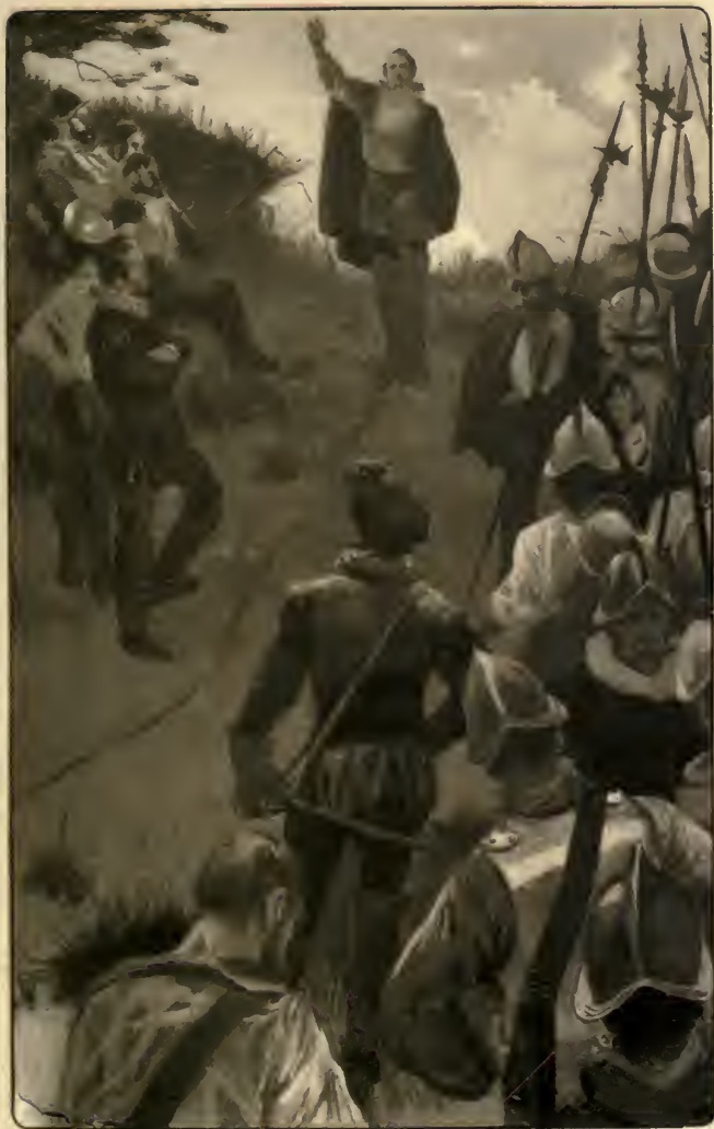
"A LINE IN THE SAND!"—Page 170.