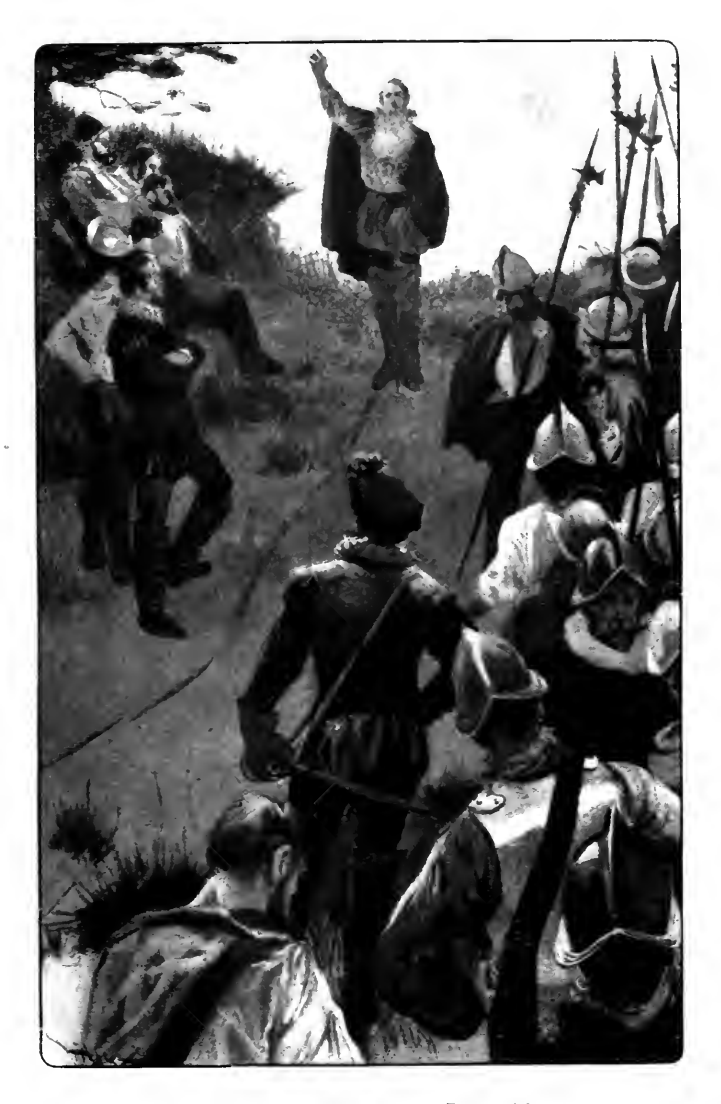
"A LINE IN THE SAND !"-Page 170.