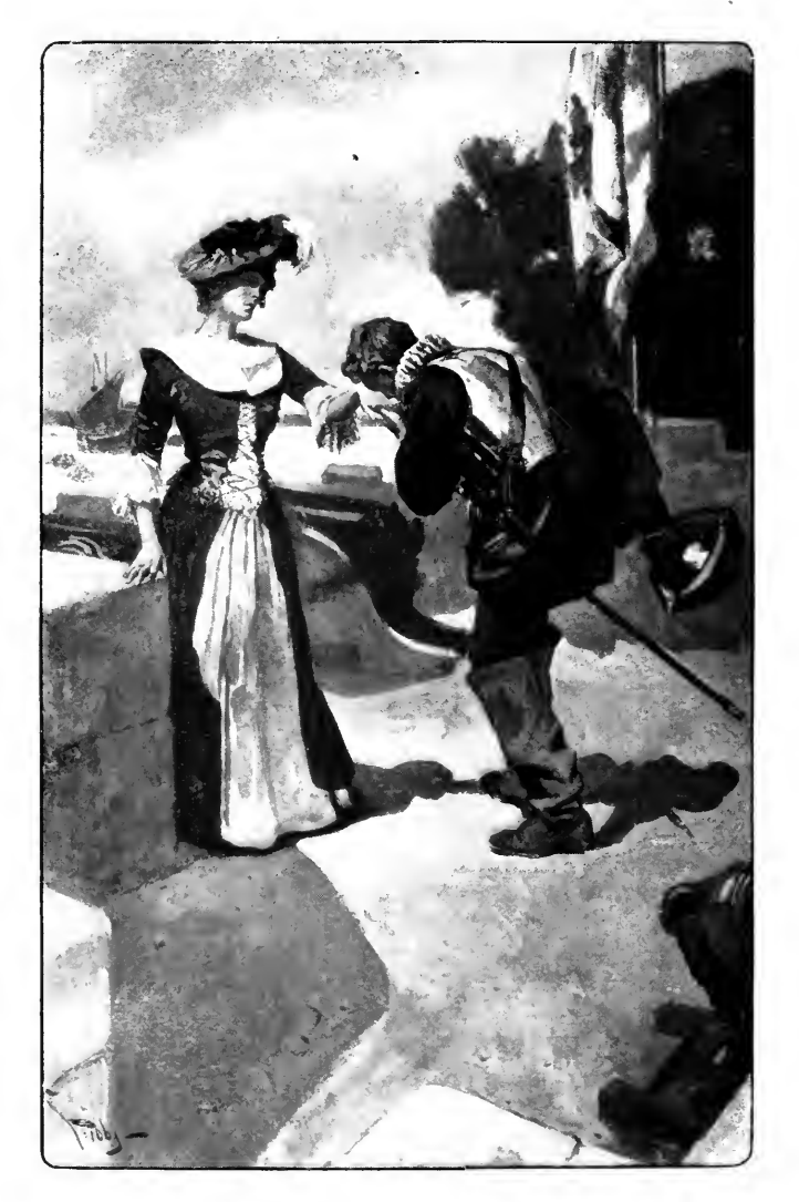
"THEN I LEFT HER."-Page 115.