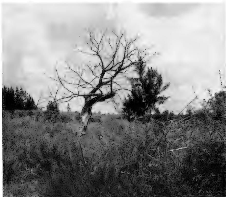
FIG. 9. Dead Spondias purpurea , northwestern South Bimini.

A far greater number of species and individuals, especially of cerambycids, was found at Rolle's burnt-over yard on the ridge which is the place we frequented most often at night.