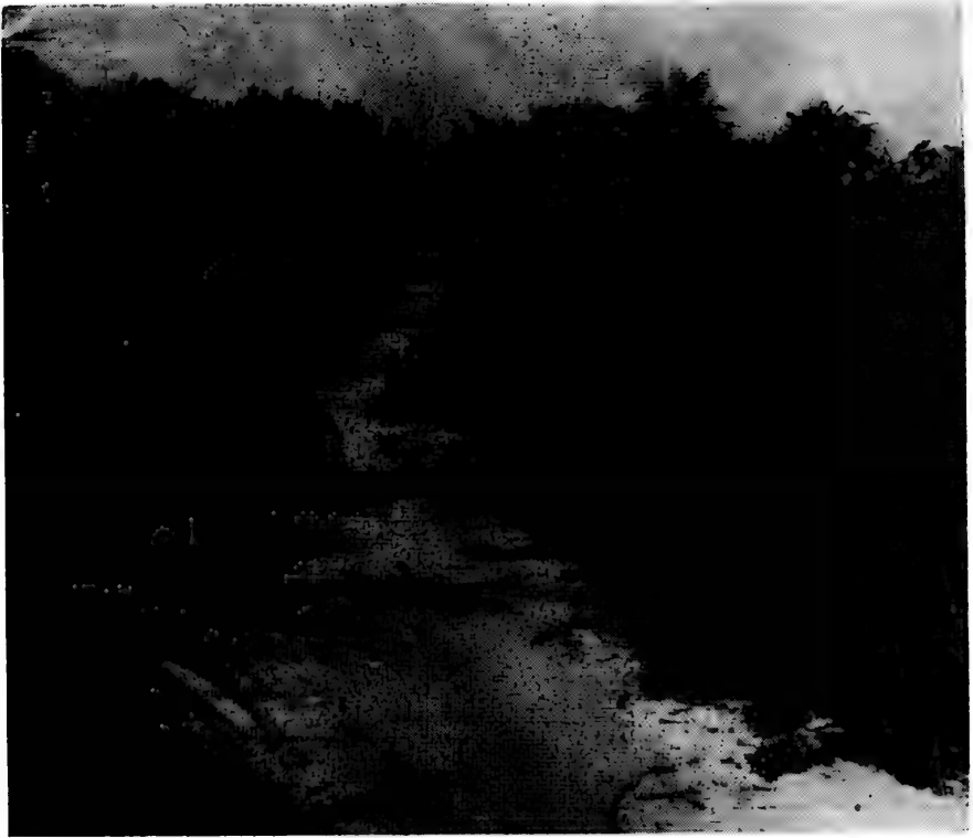
FIG. 8. Beach path looking south. Coastal rock area.

as it flew along a small inland path, Rutela formosa , a beautiful striped cetonid. He also took the second Bimini specimen of Chrysobothris tranquebarica , a buprestid that is widespread throughout the West Indies (Fisher, 1925), but seemingly scarce in the Bahamas. Its food plant is the red mangrove and the Australian pine, both plentiful in the Biminis so that it is strange no more were seen.