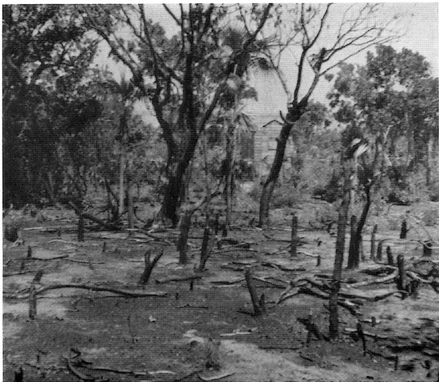
FIG. 3. Rolle's yard on Sampson's ridge; Spondias purpurea in center background.

the middle of May Cazier had found collecting excellent, especially at night. Additional chopping and firing of trees and brush around the yard went on sporadically throughout the summer, resulting in a continual supply of beetles, no matter how often we hunted for them. The rows of burnt stumps, the singed, felled, or broken trees, and the piles of dead limbs and twigs made