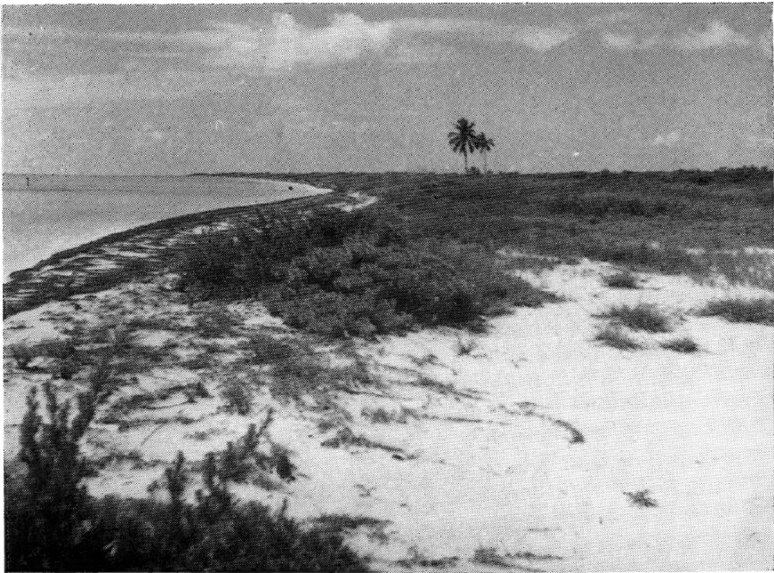
FIG. 2. East Bimini, northwestern end.

The numbers and variety of insects collected on South Bimini would no doubt have been much less had it not been for the work of a Mr. Rolle who had partially cleared and burnt an area on which he intended to build a house and raise a few crops and chickens (fig. 3). His land was situated on what is known locally