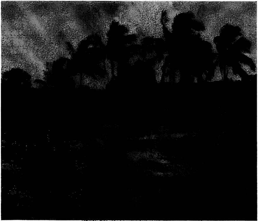
FIG. 6. Western edge of Cayelle Pond; mangrove and incipient blackland.

From Rolle's place we usually continued southward on the beach path (fig. 8) through the coastal rock community, making short excursions into the thorny shrub vegetation of palms, palmettos, and underbrush where openings of a sort had been