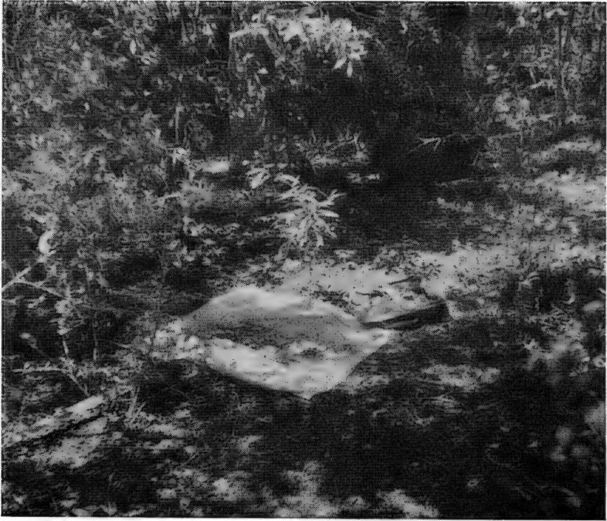
FIG. 7. "Jungle" path behind Rolle's on Sampson's ridge. Sifting for small insects.

Another daytime collecting area on South Bimini was the northeastern shore, but it could be visited at high tide only, as the bay water was too shallow for the outboard motor at other times. Much of this coast is rimmed with mangrove, but a rocky