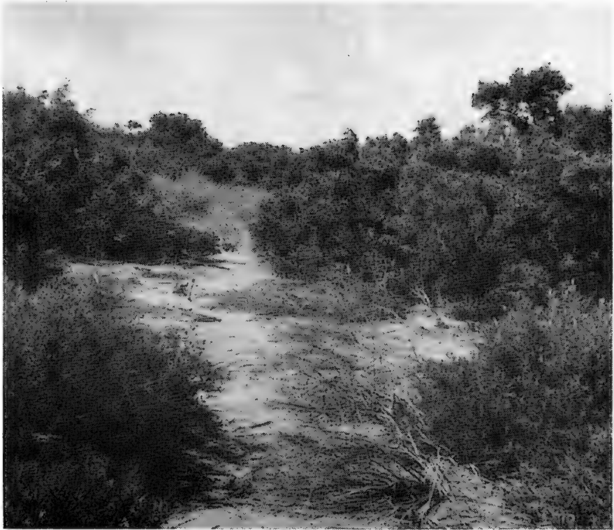
FIG. 5. Western edge of Cavelle Pond, "Paratyndaris Boulevard," with Psiloptera trees ( Laguncularia and Conocarpus ) in right background.

In what we called the "jungle" behind Rolle's yard is a narrow path along which we swept a series of a small red curculionid of