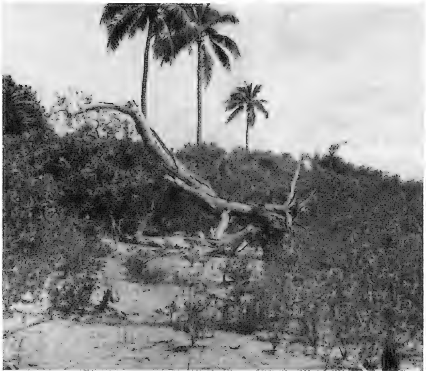
FIG. 4. Western edge of Cavelle Pond; young black mangrove ( Avicennia ) at right; white mangrove ( Laguncularia ) and button wood ( Conocarpus ) at left.

bushes and inhabited, in addition to buprestids, by tiger beetles, flies, and wasps. According to Howard (1950, p. 333) this western margin along Cavelle Pond is being invaded by some of the black land plants from the ridge (fig. 6). In a grassy area near by Cazier made an exciting capture of the variegated Acmaeodera marginenotata , a buprestid of which but one specimen had been taken the year before.