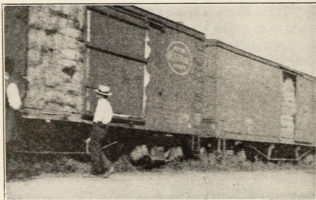
FIG. 1.—Inspecting hay by car-door method.

The easiest and quickest way of making a car-door inspection is for the inspector to stand on the ground in front of the open door and form his opinion regarding grades after looking at the exposed bales. If no-grade variation is shown by any of the bales he may be able to grade the hay fairly well from the ground. Many inspectors, however, are more painstaking than this in making car-door inspections. They carry a short light ladder about 6 feet long, which enables them to get a close view of the hay even at the top of the car. When cars are not loaded to the roof in the doorway they get into the car, so as to see as many bales as possible. Some thorough inspectors examine the hay in the opposite doorway if they are in doubt regarding grade after viewing the hay in the first doorway.