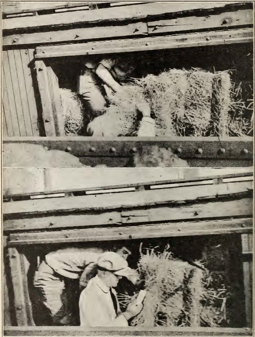
FIG. 2.—Obtaining a sample from a car of hay for use in grading and selling the hay on one of the exchanges.

at the top, since they are the most accessible bales in the car. Under these circumstances there is not much chance of securing representative samples unless the car has been loaded with hay of uniform grade, which does not occur in a large percentage of cases.