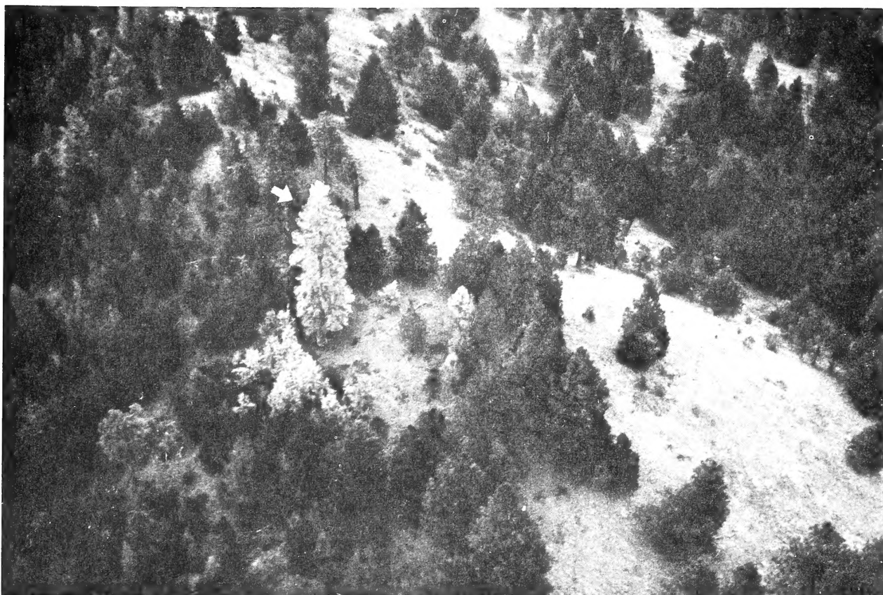
Figure 1.--Aerial view of group kill. Light-colored tree (arrow) is the lightning-struck, mature pine surrounded by dead saplings and poles.

1909; Thatcher 1960; McMullen and Atkins 1962), but little has been published about the nature of lightning damage to the struck tree, the pattern of infestation on the bole, and the extent of the beetle attack in surrounding trees as reported here.