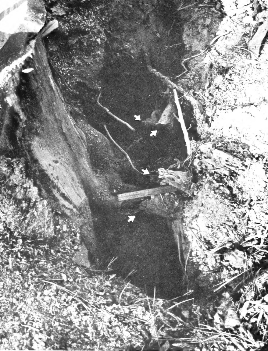
Figure 3.--Soil excavation at base of struck ponderosa pine, showing severed lateral roots (arrows). Rule is 6 in. long.

pitch tubes, abundance of emergence holes, and condition of galleries in the inner bark indicated a high rate of survival of the pine engraver. While most of the pine engraver broods had emerged from the tree at time of examination, a few callow adults and some associated insects were still present.