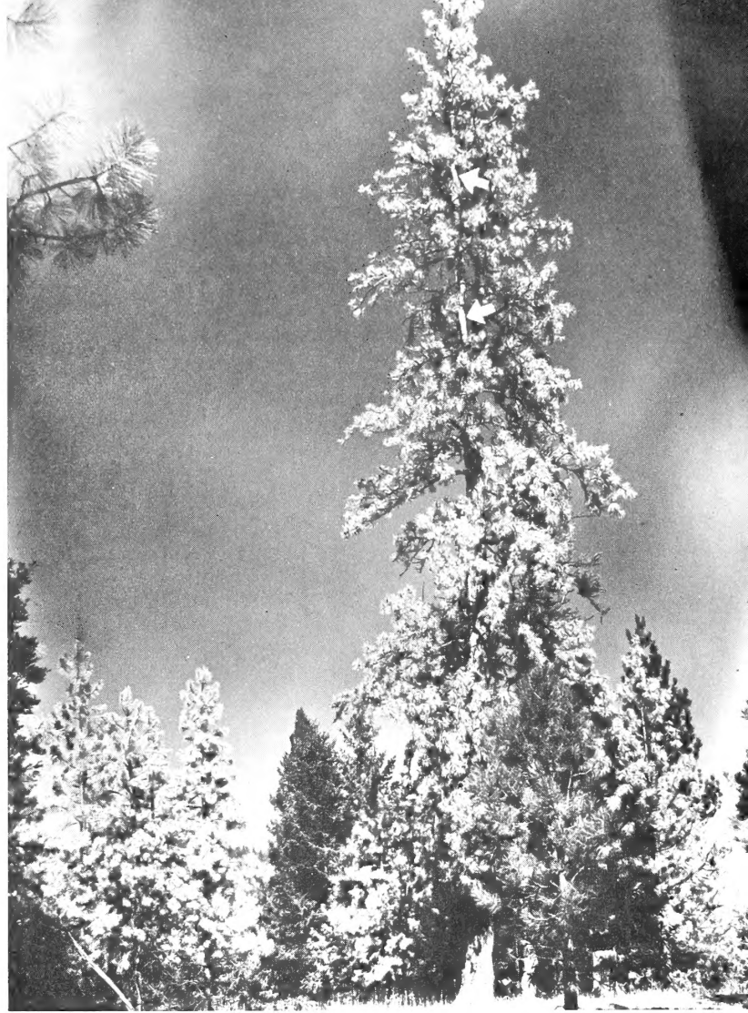
Figure 2.--Mature pine with lightning scar (arrows) and some of the surrounding trees attacked by the pine engraver.

A less commonly observed characteristic of the lightning damage was an excavation in the soil at the base of the lightning scar. Soil loosened but not ejected by the lightning was carefully removed by hand, revealing the 4- by 1- by 1-ft. excavation shown in figure 3. Several lateral roots were severed. The lightning also damaged a Douglas-fir sapling 17 ft. northeast of the struck pine, rupturing its bark and excavating some soil at its base.