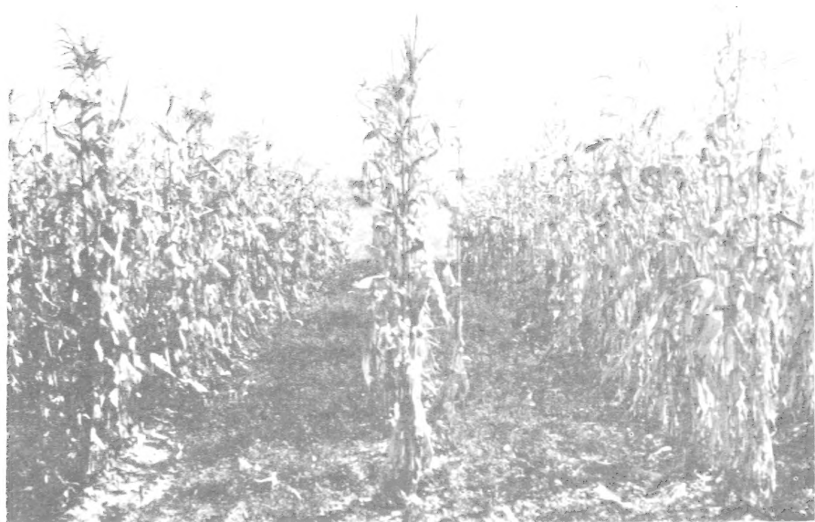
An early autumn stand of interseeded alfalfa.

Delay the first cultivation until the corn is about 6 inches tall. This cultivation fills in the depression in which the corn was planted. Two cultivations should be enough for good weed control.