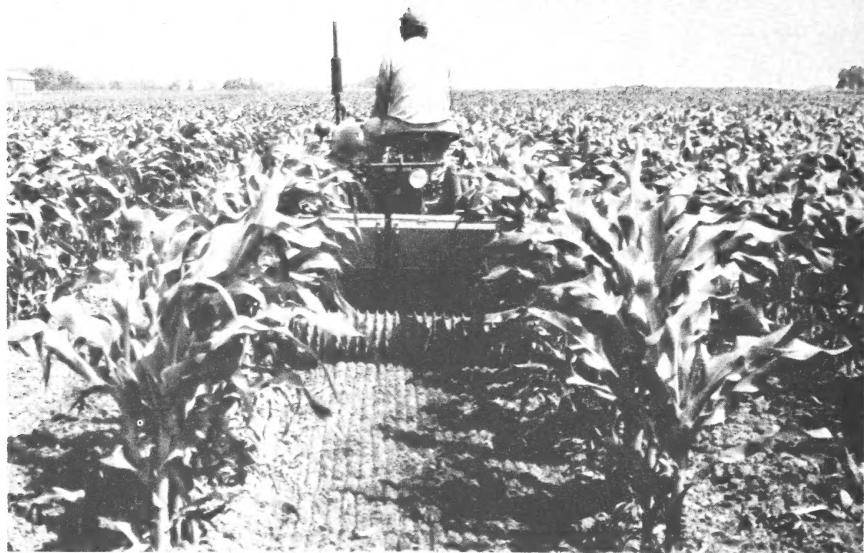
Wide rows are essential for proper growth of the interseeded legumes.