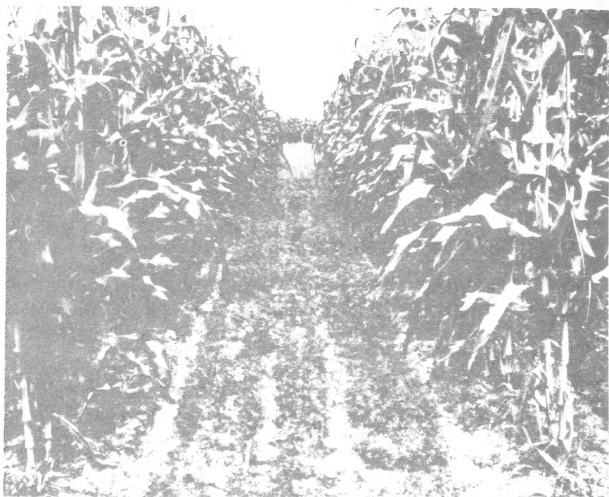
A midsummer stand of interseeded alfalfa.