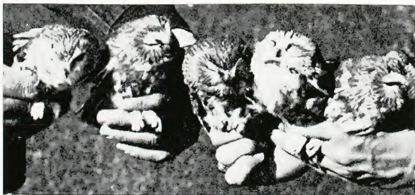
SAW-WHET OWLS BANDED OCT. 12, 1963