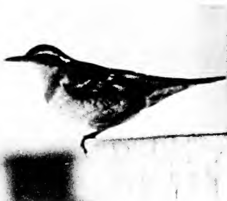
Varied Thrush at Spencer.