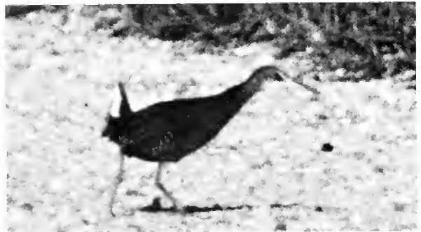
King Rail Dewey's Pasture 22 May 1984