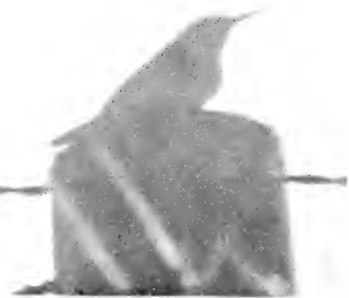
Rock Wren in grass of loess cut and silhouetted on post. NW Woodbury County, May 21, 1984.