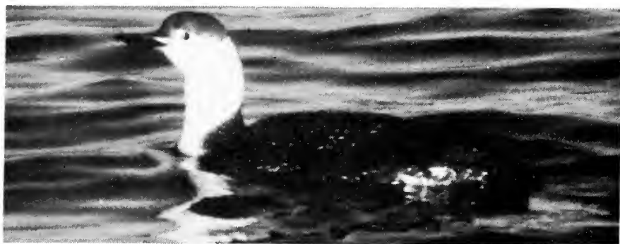
RED-THROATED LOON 6 April 1984 Cedar Lake, Cedar Rapids Linn County, Iowa

The Red-throated Loon worked its way slowly out to the center of the lake by diving and resurfacing. He was again several hundred yards out. I watched him preen for several minutes and then decided to press my luck. I pulled out my red