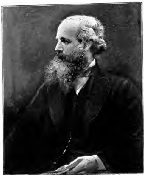
J. Clerk Maxwell