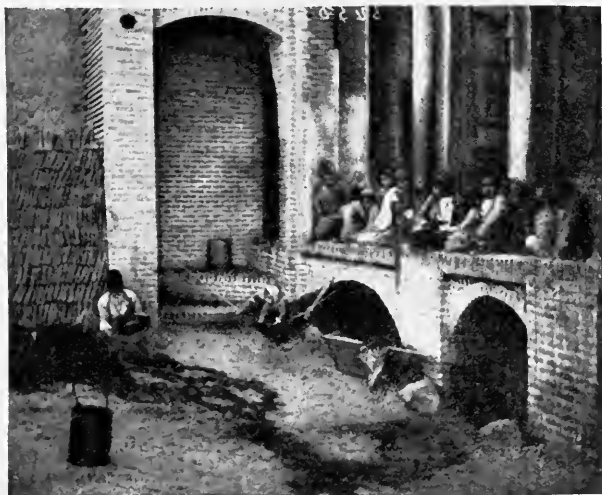
JEWISH SCHOOL AT TEHERAN

ran, but there are fourteen synagogues, and every male Jew is a regular attendant at public worship in the early morning. It was not yet seven o'clock, but I found the congregants on the point of removing their Tallith and Tephillin. However, the will I had shown to join their service was taken for the deed, and I was thus better accredited than if I had had a thousand