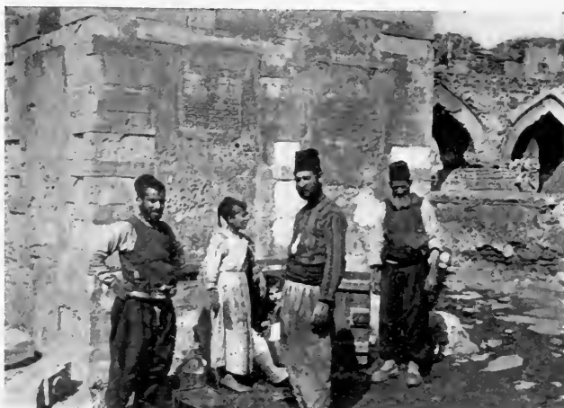
THE TALMUD TORAH AT SALONICA

But there is a humorous side to the question. It reminds one of the story of the Galician father who was so very depressed. "What is the matter?" asked his friend. "I have promised my daughter's young man a Nedan of five hundred gulden, and there are