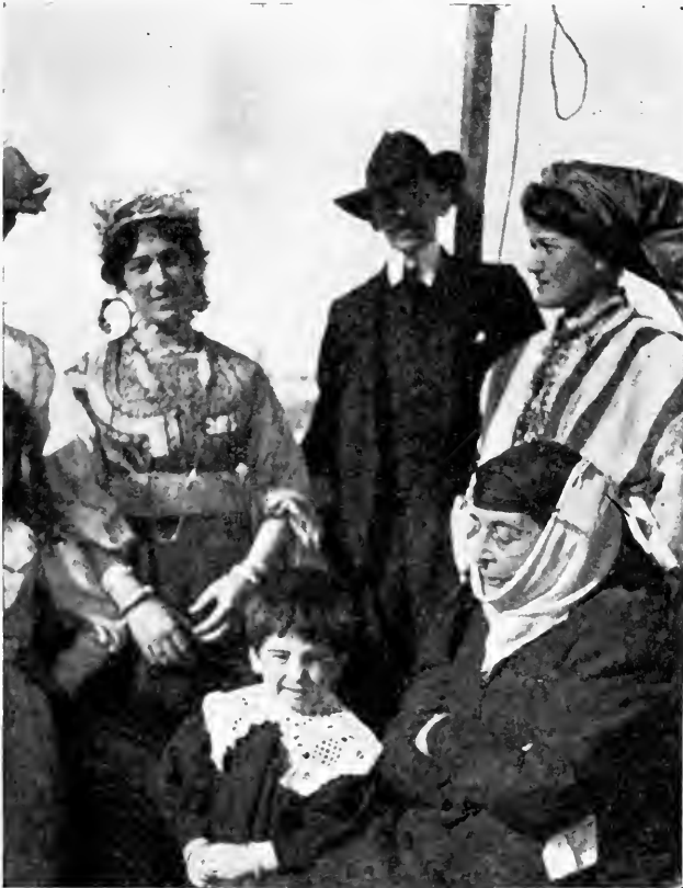
SPANISH COSTUMES OF JEWESSES IN ALGIERS

even of Gibraltar appeal on questions of doctrine and dogma and ritual.