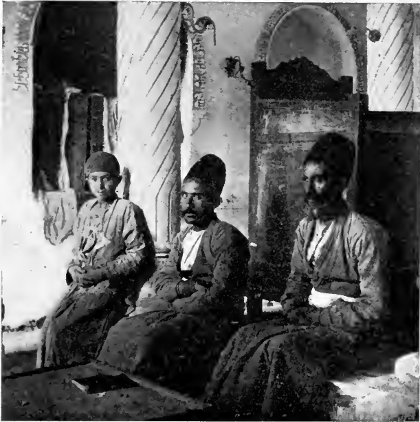
THE GREAT SYNAGOGUE AT TEHERAN

Lift up your heads, O ye gates; and be lifted up, ye everlasting doors!