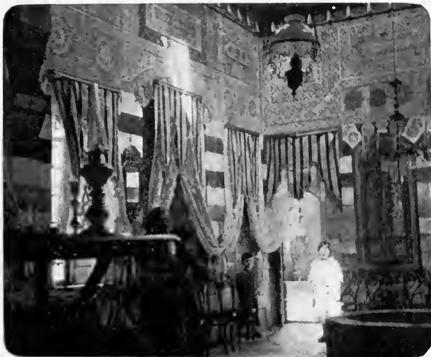
JEWISH INTERIOR AT DAMASCUS