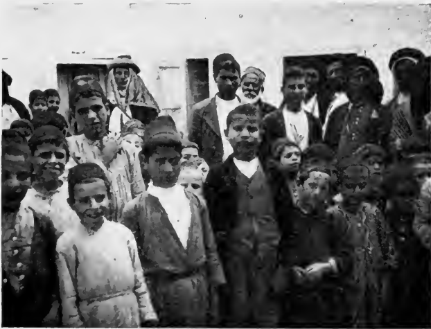
TYPES OF JEWISH SCHOOL CHILDREN