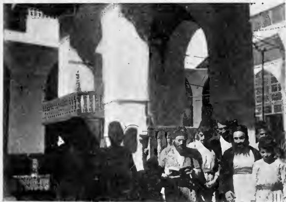
SYNAGOGUE AT ALEPPO

Only four letters are starred, so that the date is probably 1145, sel. = 834. The local Jews, however, assume that all the letters count in the פרט, but that