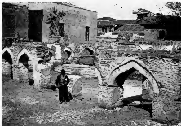
CATALAN SYNAGOGUE AT SALONICA

improved; au contraire . But I am bound to say that the richer kind of Salonica Jewess, who has abandoned such Orientalisms, "enjoys" a worse reputation than her sister. The Jewesses are not ugly. The national costume is becoming—a flat cap terminating in a broad green (occasionally red) sash about a foot long and six inches wide, with a white lace tunic something like the Angelica-Kauffmann bodice.