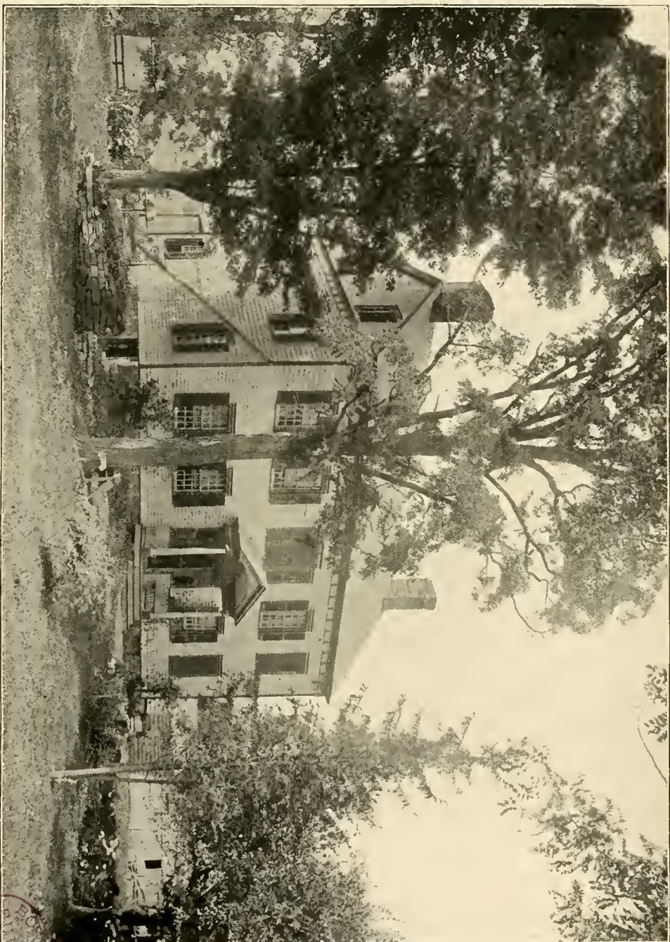
HOUSE BUILT BY DANIEL BUTTS ABOUT 1811.