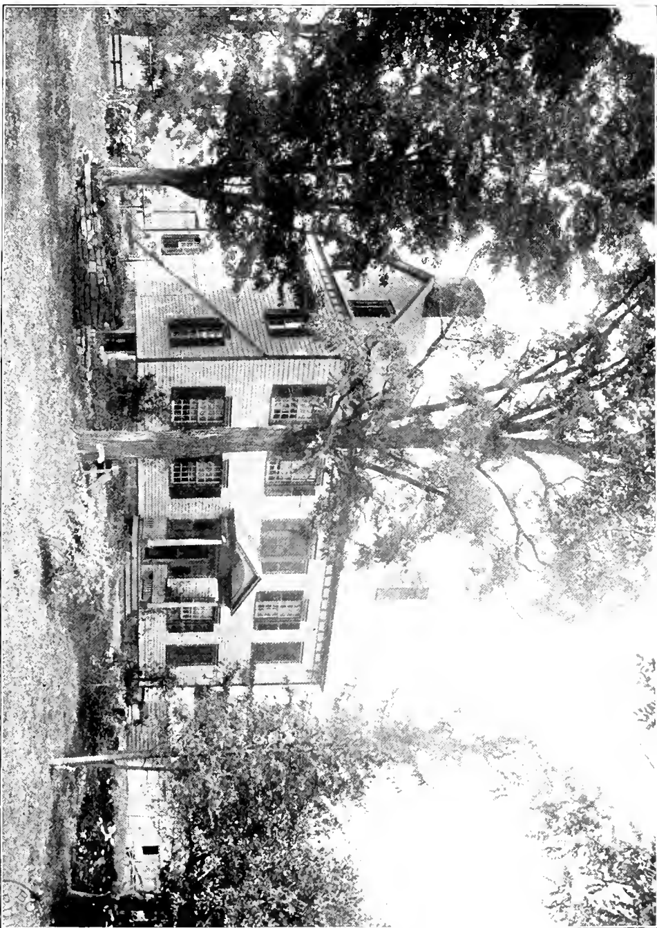
HOUSE BUILT BY DANIEL BUTTS ABOUT 1811.