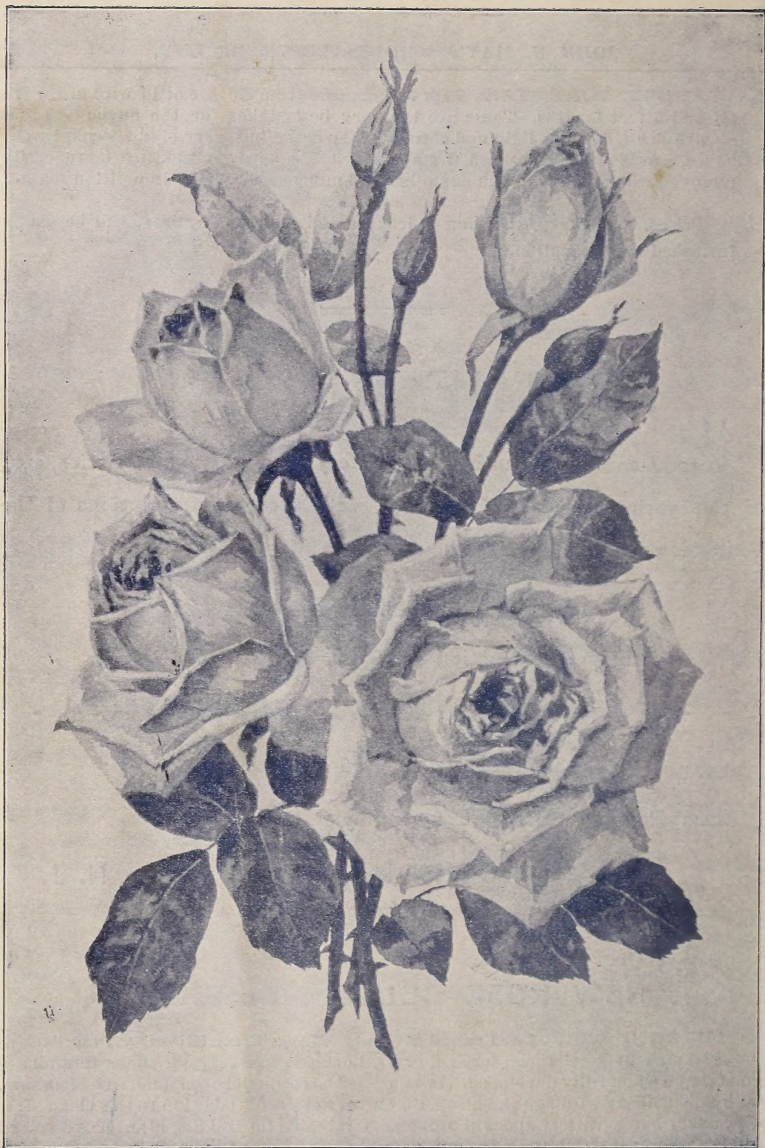
NEW ROSE BELLE 'SIEBRECHT.