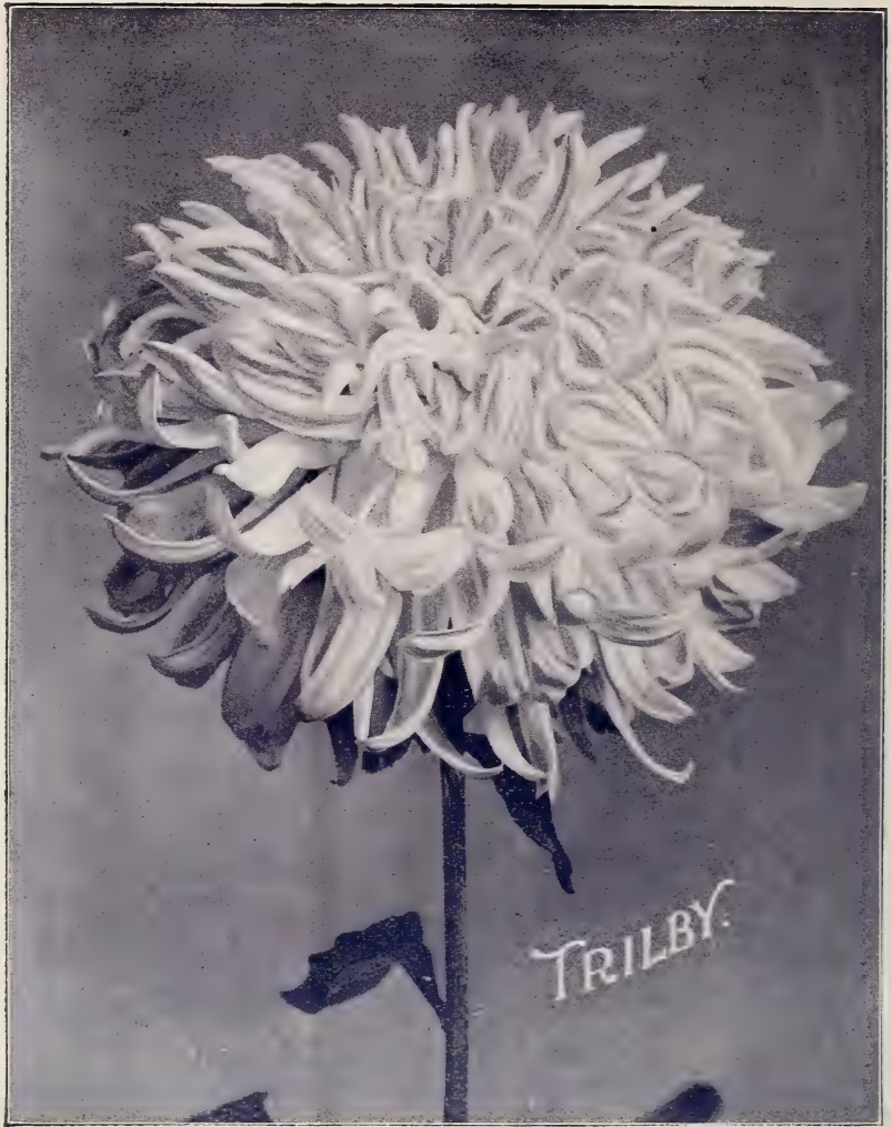
(See full description page 11.)