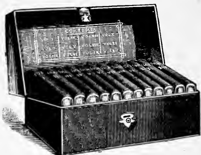
Sketch showing paste grain style, with round corners, in new box case.

The Volumes are of the handiest possible size, each measuring 3\frac{1}{2} by 5 inches, and they are exquisitely printed on fine paper from New Type specially chosen for its clearness.