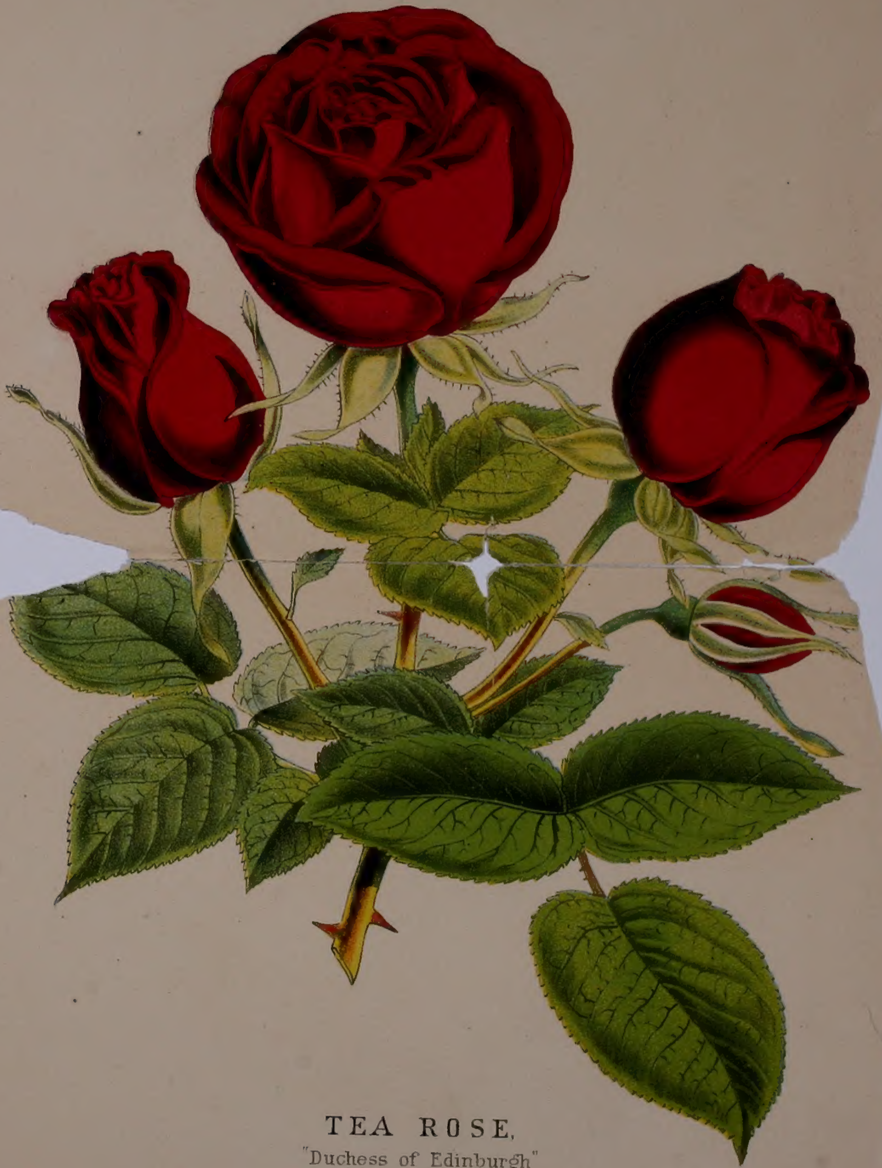
TEA ROSE, "Duchess of Edinburgh"