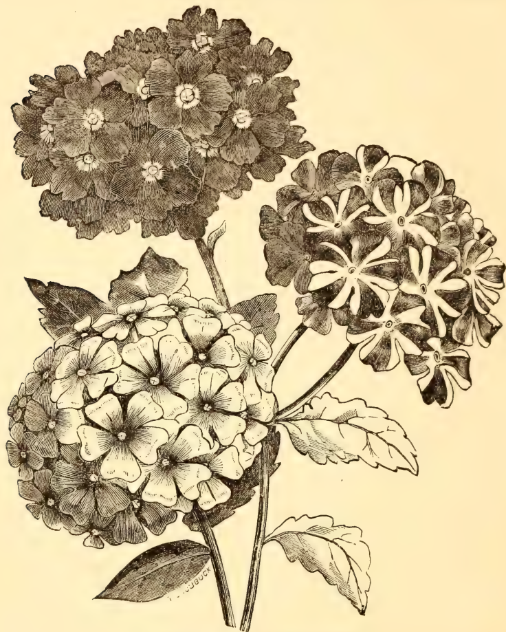
GROUP OF VERBENAS.