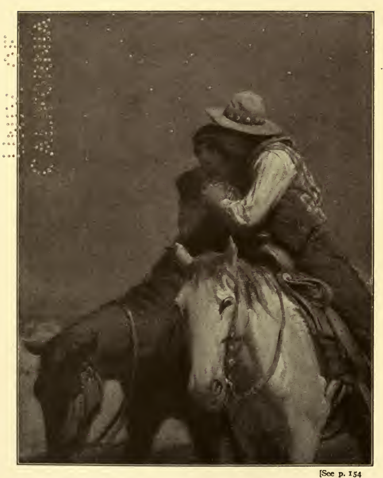
PETER'S HAND SOUGHT HERS, AND ALL HER WOMAN'S FEAR OF THE VAGUE TERRORS OF THE DREADFUL NIGHT SPOKE IN HER ANSWERING PRESSURE