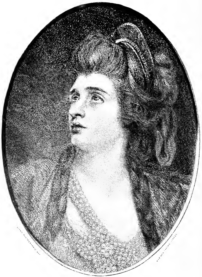
Mrs. Siddons as the character of the Tragic Muse.