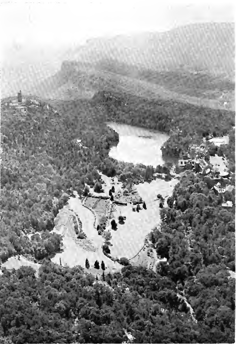
Aerial view of Lake Mohonk area