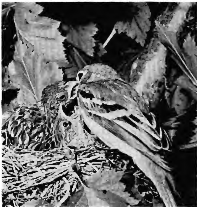
Least Flycatcher ( Empidonax minimus ) feeding the young Chipping Sparrows.