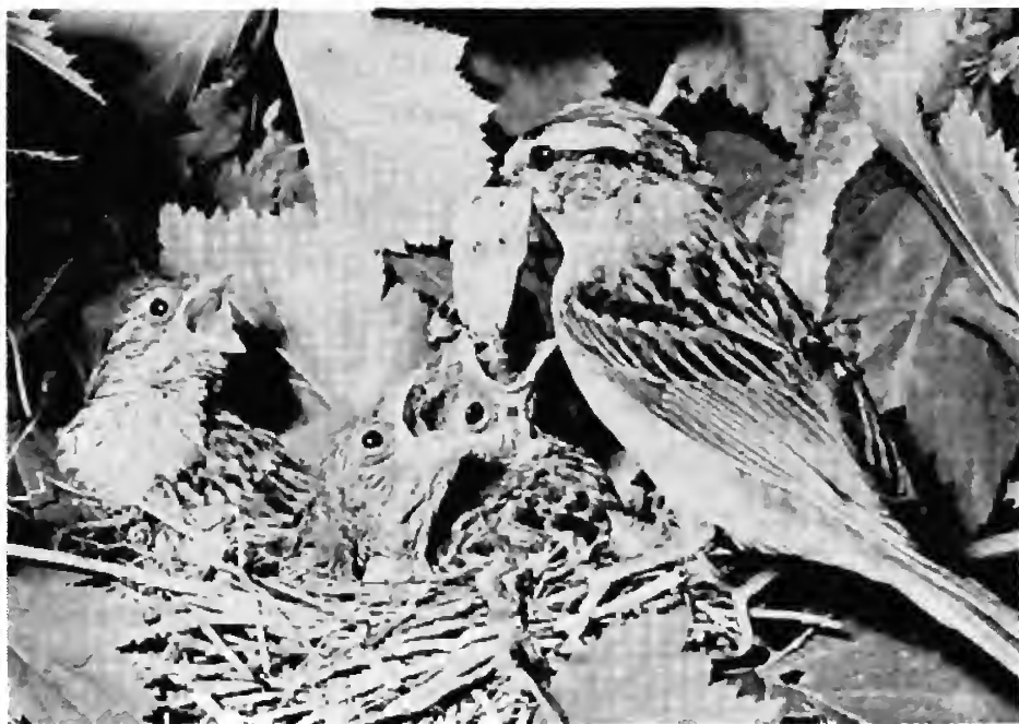
Chipping Sparrow ( Spizella passerina ) bringing food to its young in the nest.