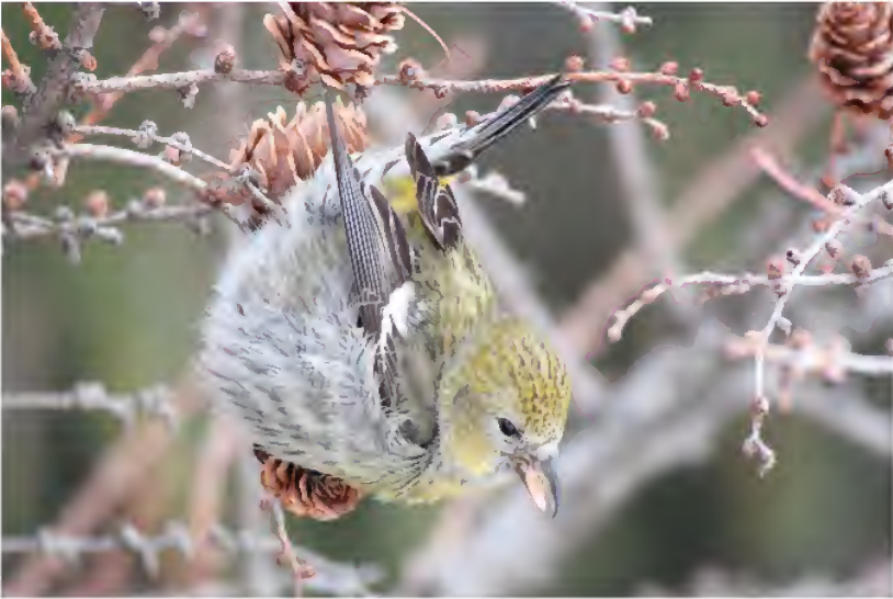
Figure B. White-winged Crossbills, Golden Hill SP, Niagara County, 19 Jan 09, copyright Brad Carlson.