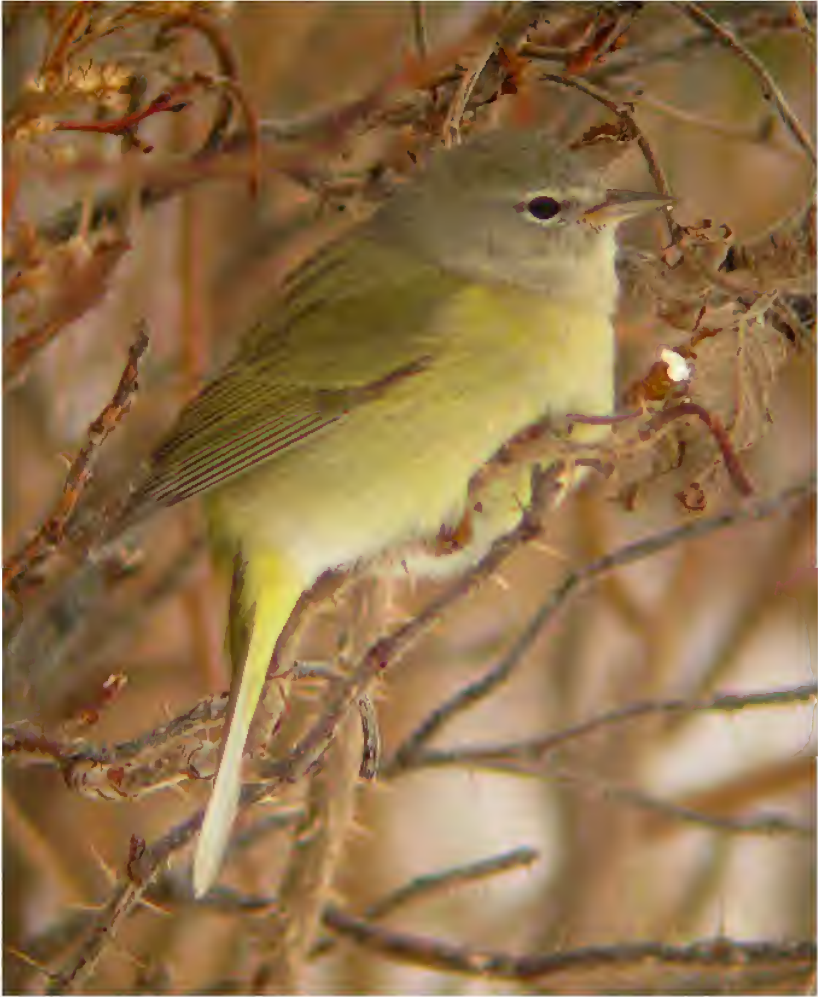
Figure A. Orange-crowned Warbler, Jamaica Bay Wildlife Refuge, Kings County, 20 Dec 08, copyright Doug Gochfeld.