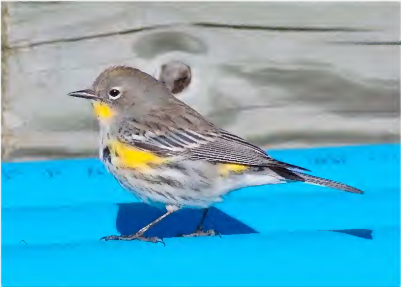
Figure D. “Eurasian” Green-winged Teal, Milburn Pond, Nassau County, 24 Jan 09, “Audubon’s” Yellow-rumped Warbler, Tobay, Nassau County, 4 Jan 09