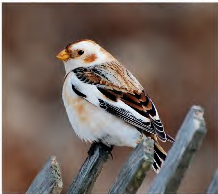
Figure C. White-winged Crossbill, Jones Beach West End, Nassau County, 20 Jan 09, copyright Ken Feustel; Snow Bunting, Jones Beach West End, Nassau County 26 Dec 08, copyright Ken Feustel.