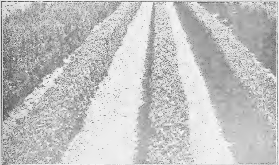
A 3-yr. block of "Truehedge Columberry" which has received one rough trimming. The "Immediate Hedge Effect" is exceptionally pronounced.