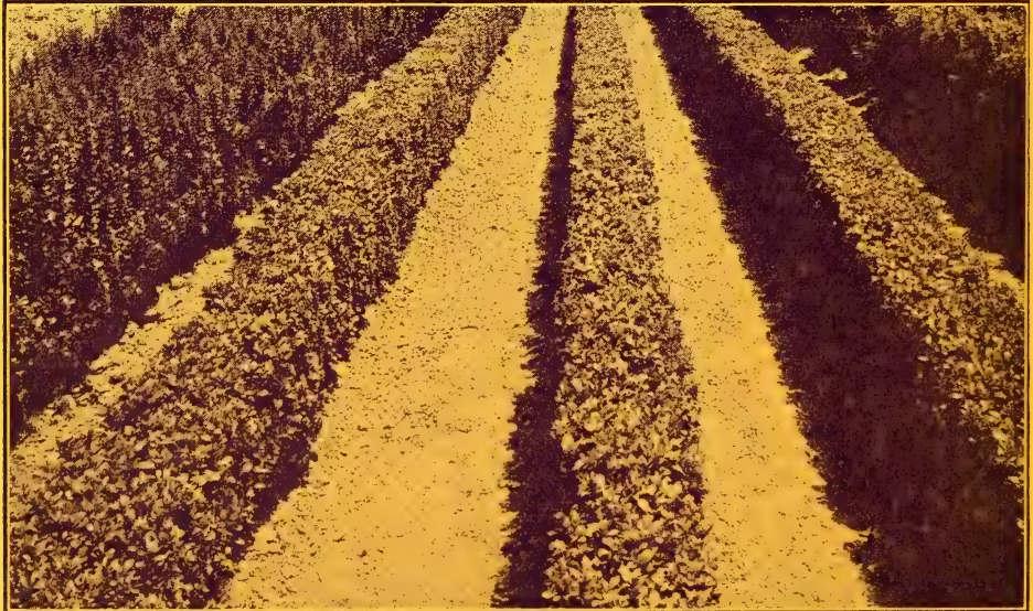
A 3-yr. block of "Truehedge Columberry" which has received one rough trimming. The "Immediate Hedge Effect" is exceptionally pronounced.