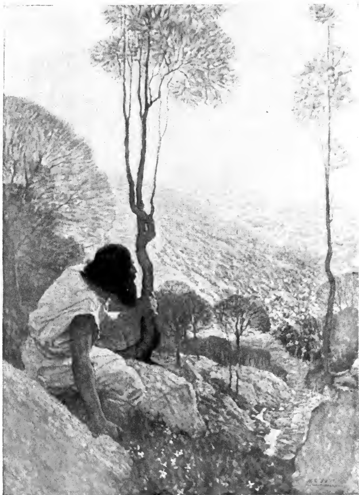
Drawn by N. C. Wyeth.

ALL DAY, HELD SPELL-BOUND BY THIS WONDERFUL SIGHT, THE HERMIT CROUCHED IN THE SHADOW OF THE ROCKS.