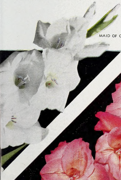
MAID OF ORLEANS