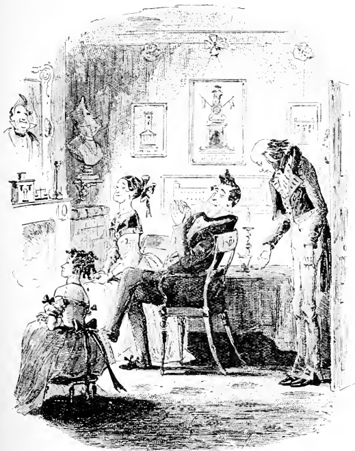
MEEKNESS OF MR. PECKSNIFF AND HIS CHARMING DAUGHTERS.