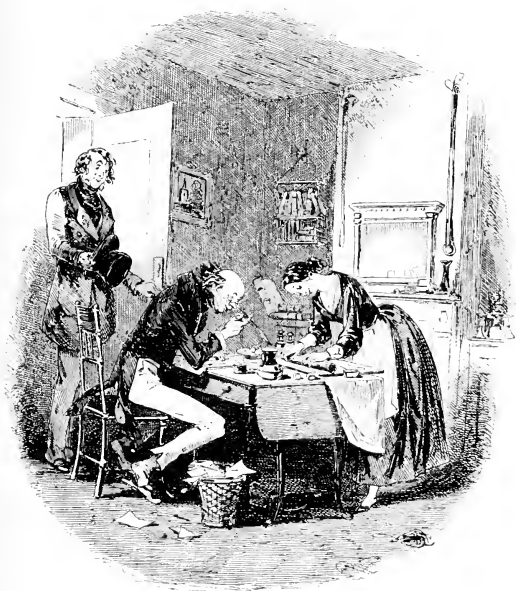
MR. PINCH AND RUTH, UNCONSCIOUS OF A VISITOR.