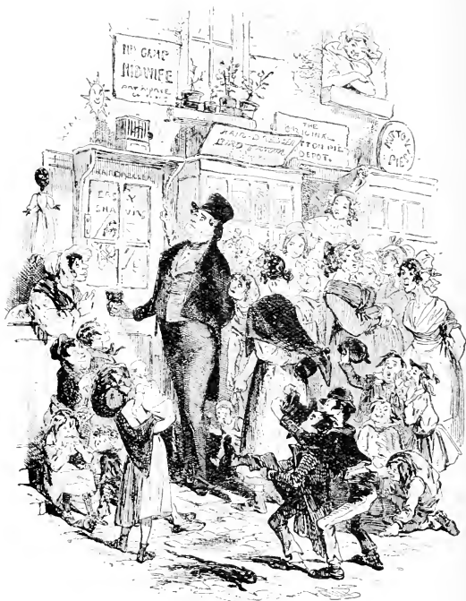
MR. PECKSNIFF ON HIS MISSION.