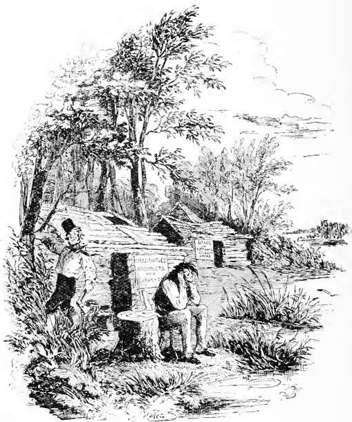
THE THRIVING CITY OF EDEN, AS IT APPEARED IN FACT.