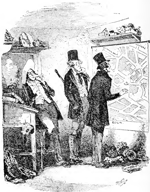
THE THRIVING CITY OF EDEN, AS IT APPEARED ON PAPER.