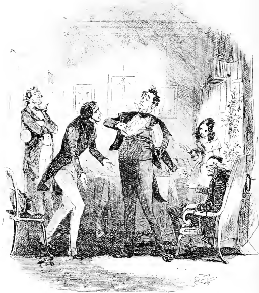
MR. PECKSNIFF ANNOUNCES HIMSELF AS THE SHIELD OF VIRTUE.