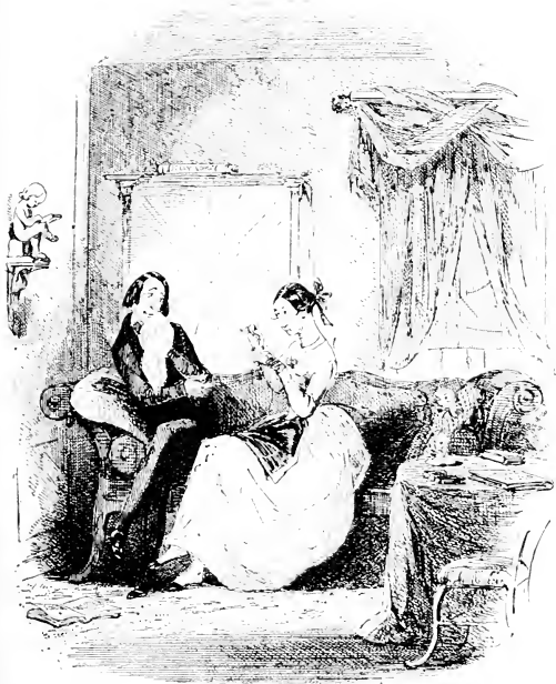
MR. MODDLE IS BOTH PARTICULAR AND PECULIAR IN HIS ATTENTIONS.