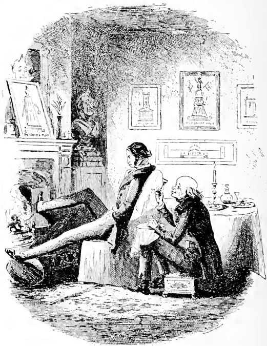
MR. PINCH AND THE NEW PUPIL, ON A SOCIAL OCCASION.