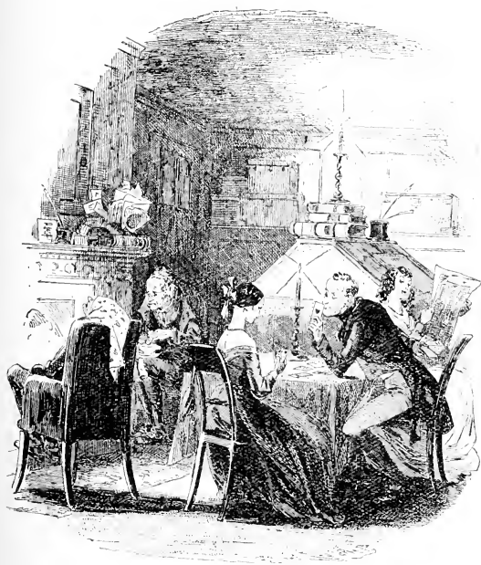
MR. JONAS CHUZZLEWIT ENTERTAINS HIS COUSINS.