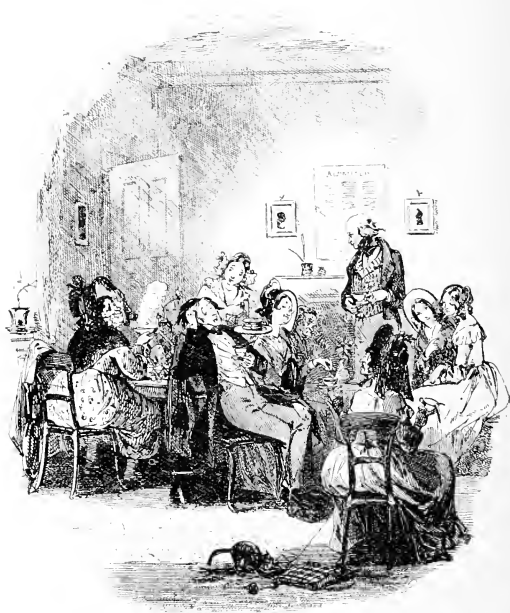
MRS. GAMP MAKES TEA.