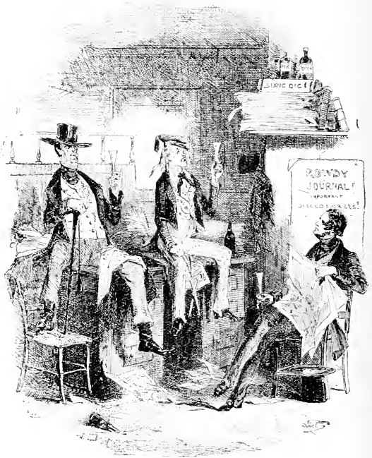
MR. JEFFERSON BRICK PROPOSES AN APPROPRIATE SENTIMENT.