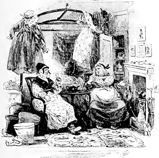
MRS. GAMP PROPOGES A TOAST.