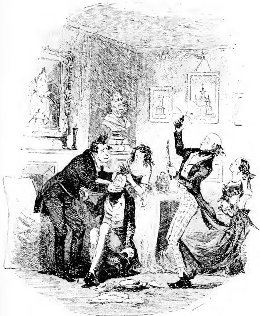
BALM FOR THE WOUNDED ORPHAN.