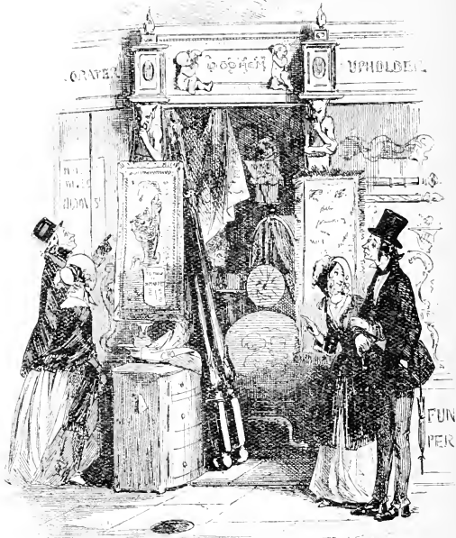
MR. MODDLE IS LED TO THE CONTEMPLATION OF HIS DESTINY.