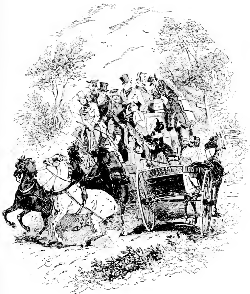
MR. PINCH DEPARTS TO SEEK HIS FORTUNE.