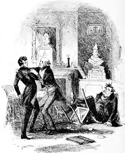
MR. PECKSNIFF RENOUNCES THE DECEIVER.