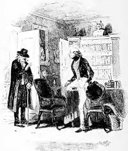
MR. PINCH IS AMAZED BY AN UNEXPECTED APPARITION