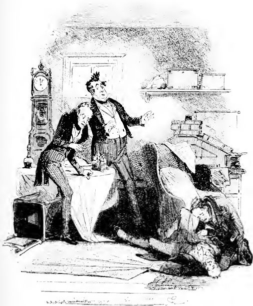
THE DISSOLUTION OF PARTNERSHIP.