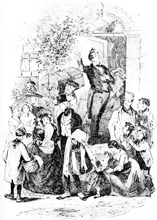
MR. PECKSNIFF DISCHARGES A DUTY WHICH HE OWES TO SOCIETY.