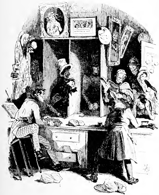
MARTIN MEETS AN ACQUAINTANCE, AT THE HOUSE OF A MUTUAL RELATION.