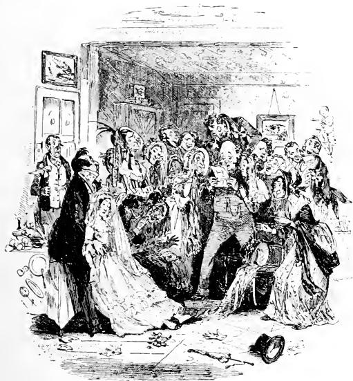
THE NUPTIALS OF MISS PECKSNIFF RECEIVE A TEMPORARY CHECK.