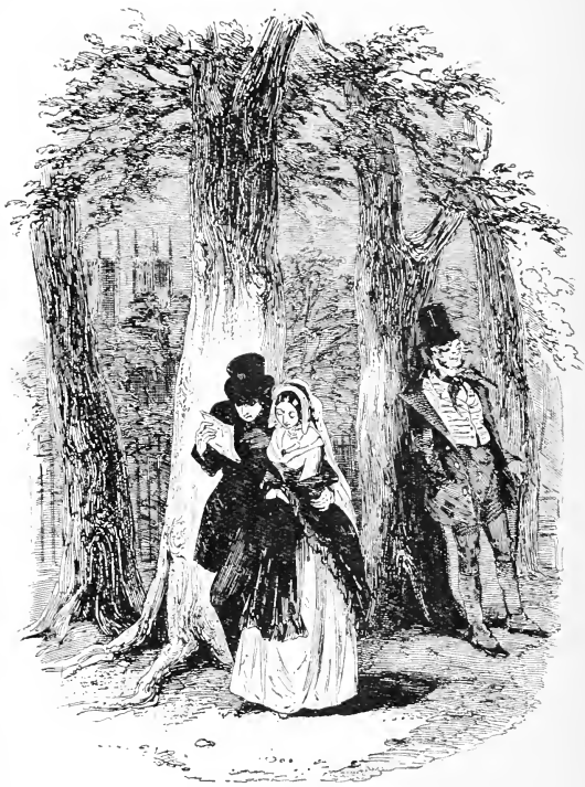
MR. TAPLEY ACTS THIRD PARTY, WITH GREAT DISCRETION.