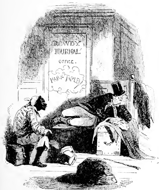
MR. TAPLEY SUCCEEDS IN FINDING A "JOLLY" SUBJECT FOR CONTEMPLATION.