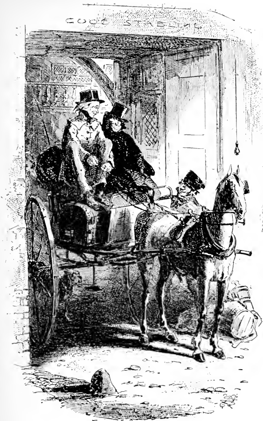
PINCH STARTS HOMEWARD WITH THE NEW PUPIL.