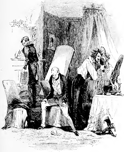
MR. NADGETT BREATHES, AS USUAL, AN ATMOSPHERE OF MYSTERY.