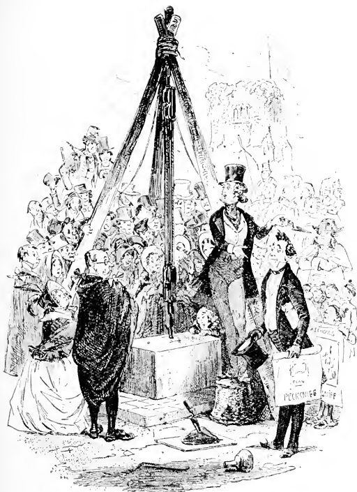
MARTIN IS MUCH GRATIFIED BY AN IMPOSING CEREMONY.