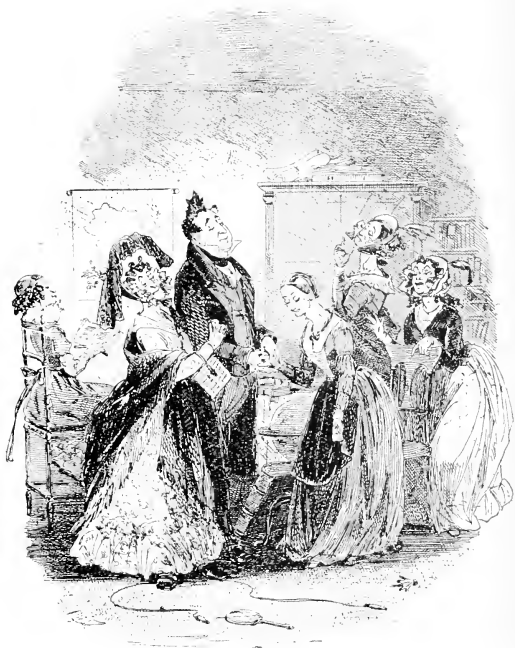
M. TODGERS AND THE PECKSNIFFS, CALL UPON MISS PINCH.