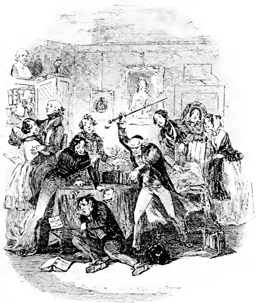
WARM RECEPTION OF MR. PECKSNIFF BY HIS VENERABLE FRIEND.