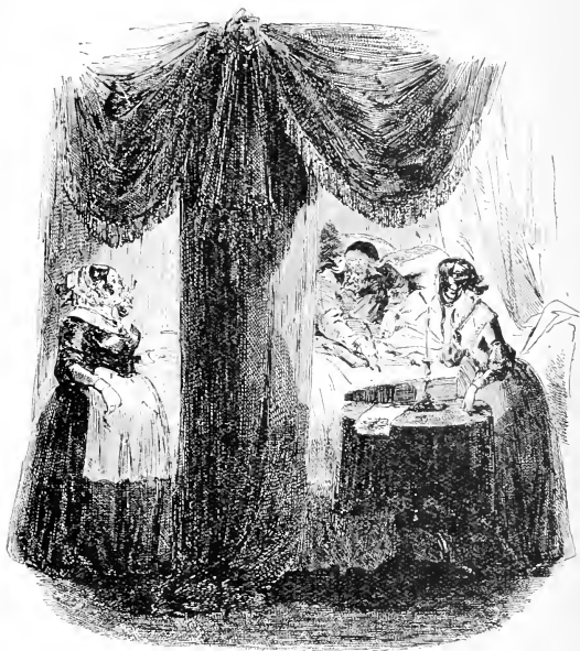
MARTIN CHUZZLEWIT SUSPECTS THE LANDLADY WITHOUT ANY REASON.