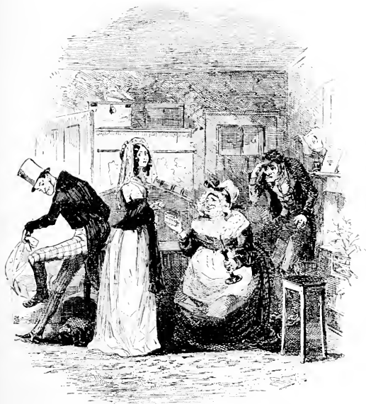
MRS. GAMP HAS HER EYE ON THE FUTURE.