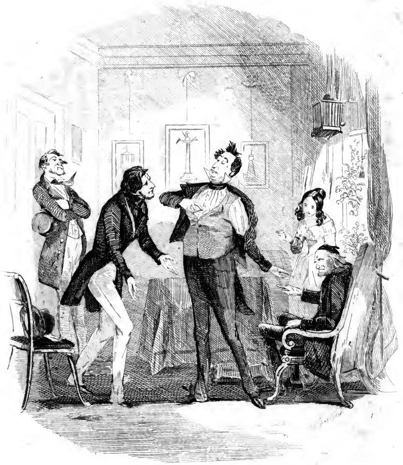
Mr. Picksniff announces himself as the shield of Virtue