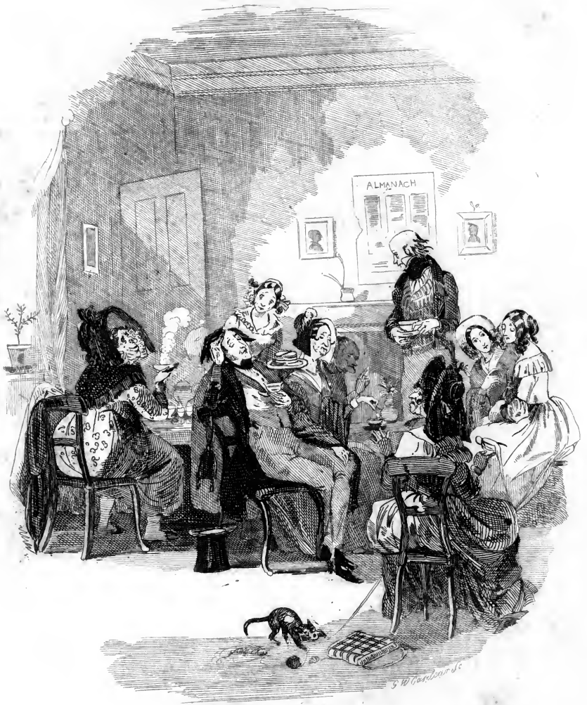
Mrs Gamp makes tea.