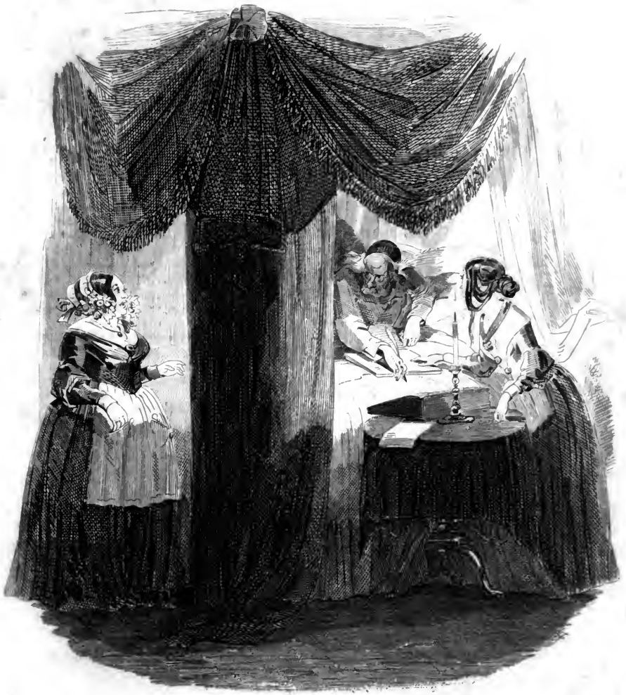
Martin Chuzzlewit suspects the landlady, without any reason