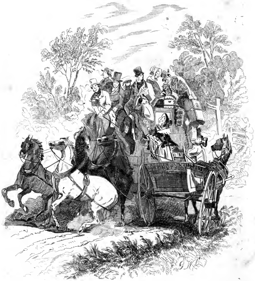
Mr. Pouch departs to seek his fortune.