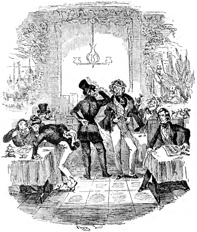
NICHOLAS ATTRACTED BY THE MENTION OF HIS SISTER'S NAME IN THE COFFEE ROOM.