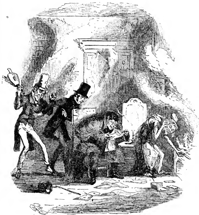
MR. SQUEERS AND MRS. SLIDERSKEW UNCONSCIOUS OF VISITORS.