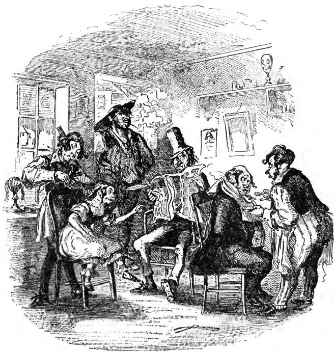
GREAT EXCITEMENT OF MISS KENWIGS AT THE HAIR-DRESSER'S SHOP