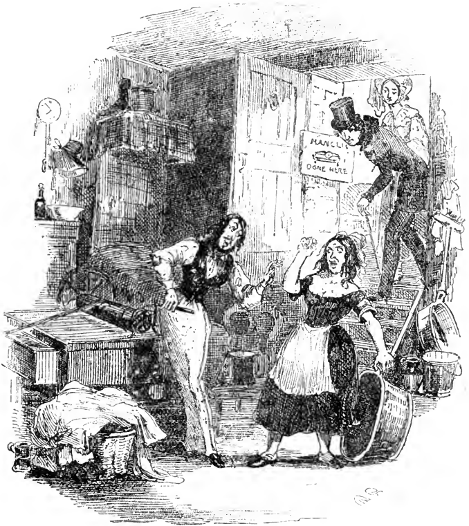
REDUCED CIRCUMSTANCES OF MR. MANTALINI.