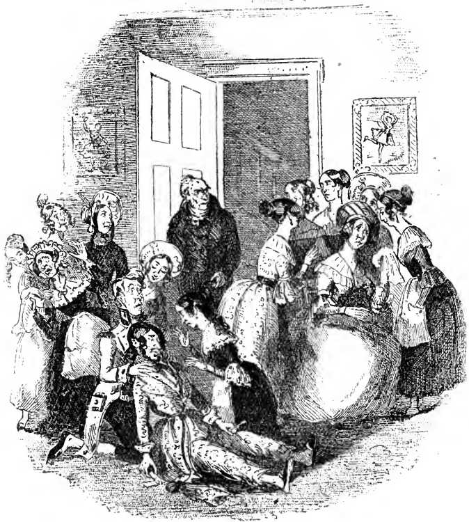
MR. MANTALINI POISONS HIMSELF FOR THE SEVENTH TIME.