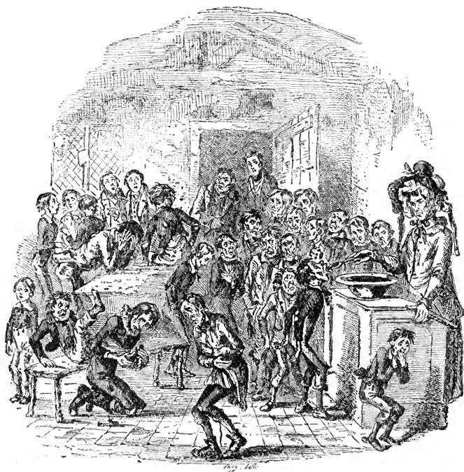
THE INTERNAL ECONOMY OF DOTHEBOYS HALL.