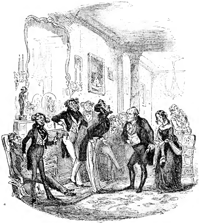
MISS NICKLEBY INTRODUCED TO HER UNCLE'S FRIENDS.