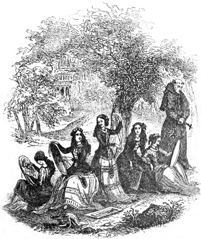
THE FIVE SISTERS OF YORK.