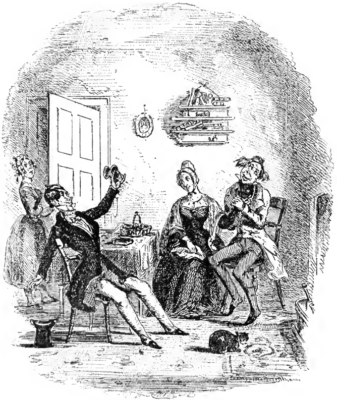
AFFECTIONATE BEHAVIOUR OF MESSRS. PYKE AND PLUCK.