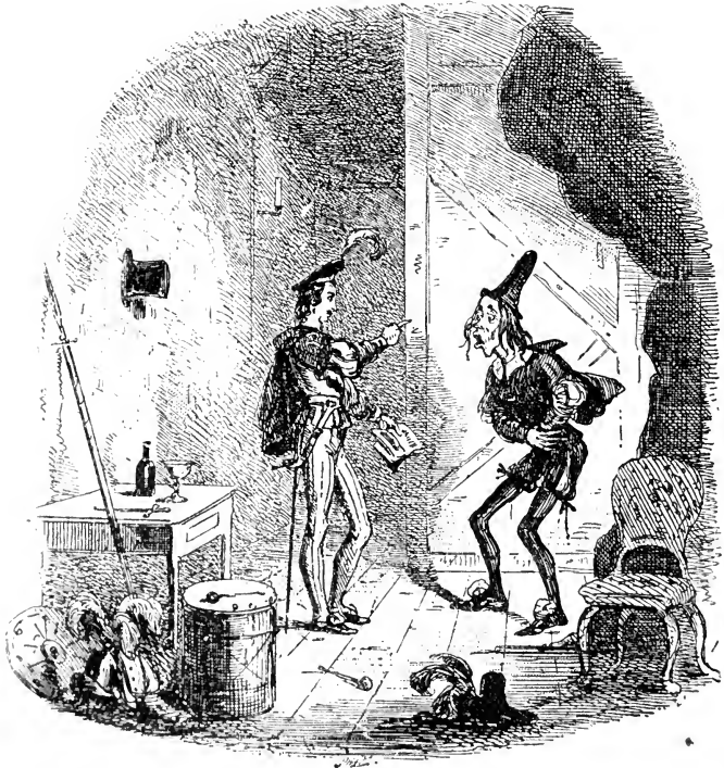
NICHOLAS INSTRUCTS SMIKE IN THE ART OF ACTING.