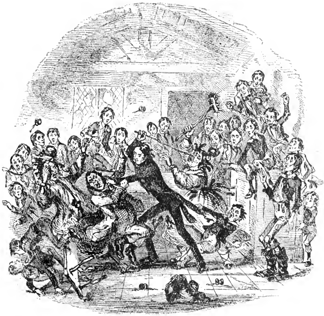
NICHOLAS ASTONISHES MR. SQUEERS AND FAMILY.