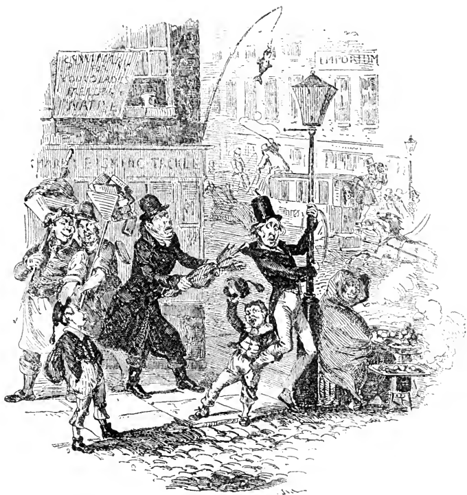
A SUDDEN RECOGNITION UNEXPECTED ON BOTH SIDES.