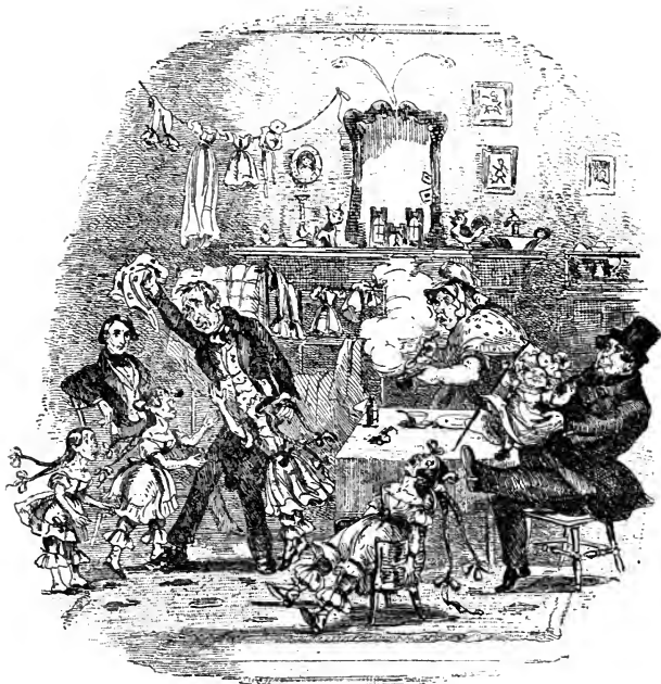
EMOTION OF MR. KENWIGS ON HEARING THE FAMILY NEWS FROM NICHOLAS.