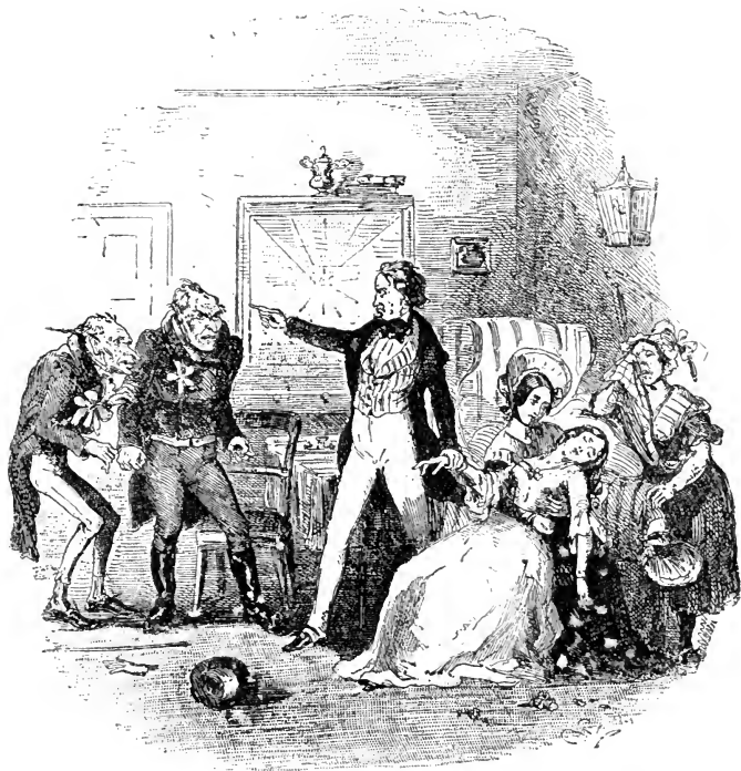
NICHOLAS CONGRATULATES ARTHUR GRIDE ON HIS WEDDING MORNING.