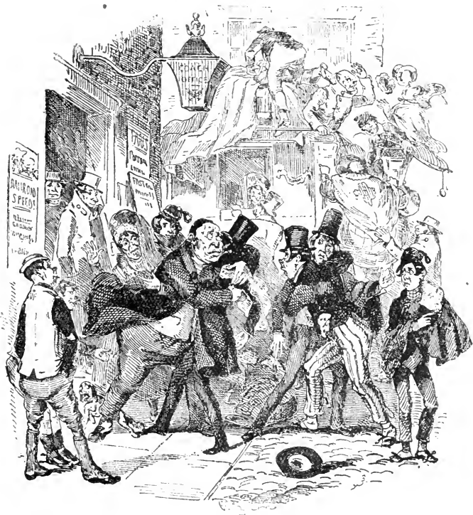
THEATRICAL EMOTION OF MR. VINCENT CRUMMLES.