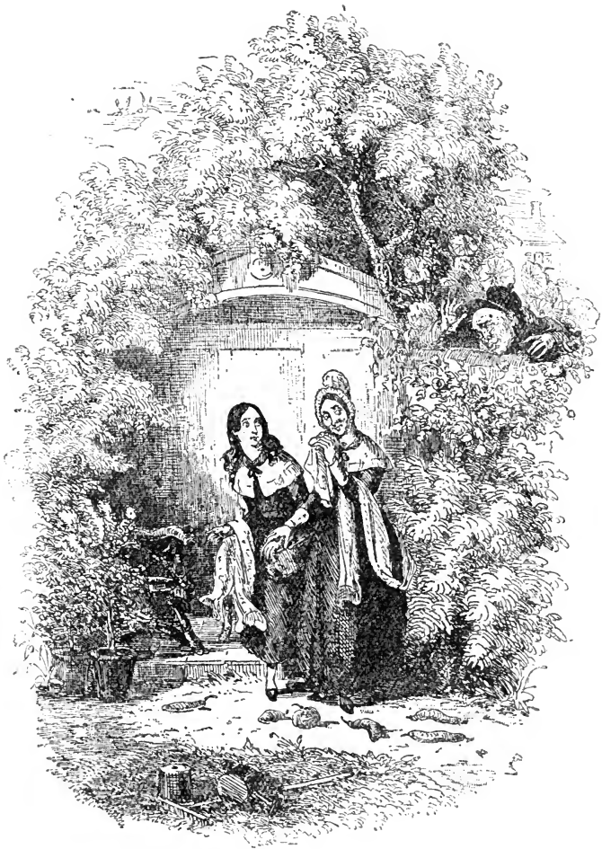
THE GENTLEMAN NEXT DOOR DECLARES HIS PASSION FOR MRS. NICKLEBY.