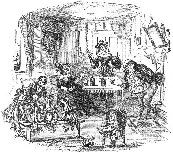
NICHOLAS ENGAGED AS A TUTOR IN A PRIVATE FAMILY.