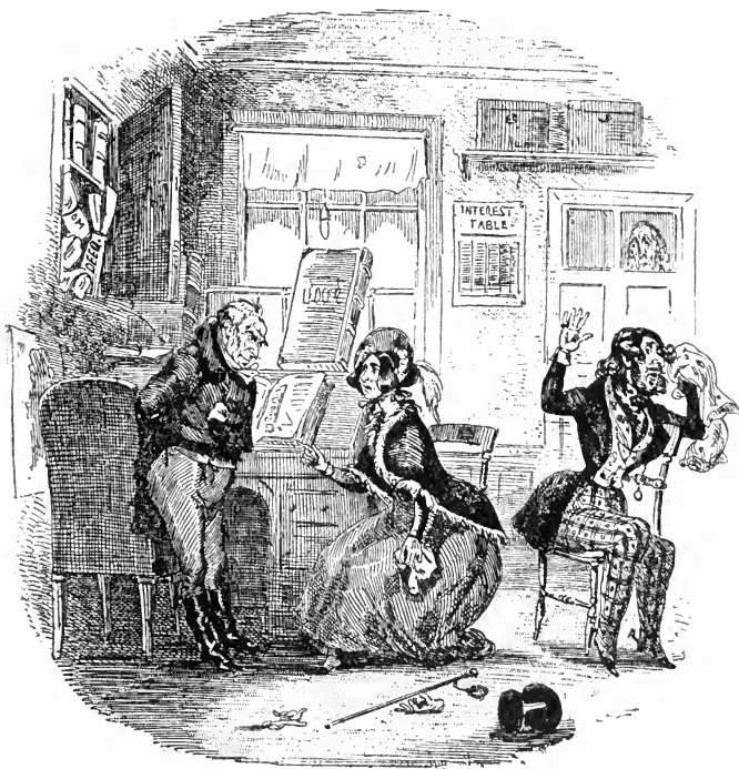
MR. AND MRS. MANTALINI IN RALPH NICKLEBY'S OFFICE.