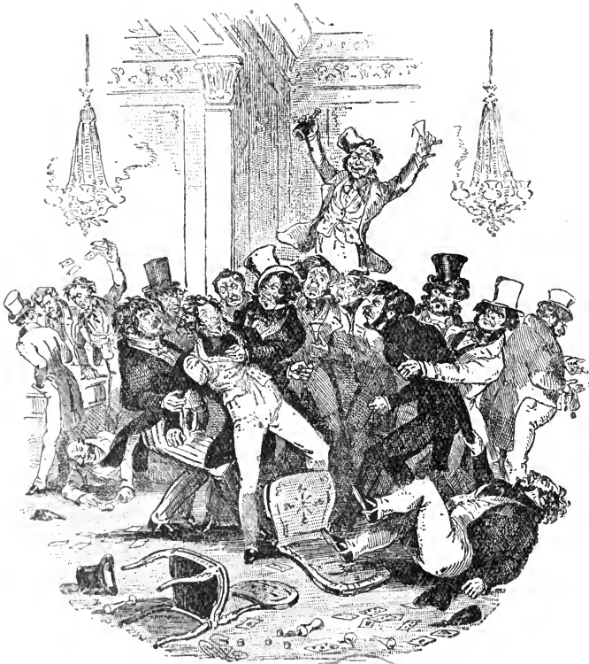
THE LAST BRAWL BETWEEN SIR MULBERRY AND HIS PUPIL.