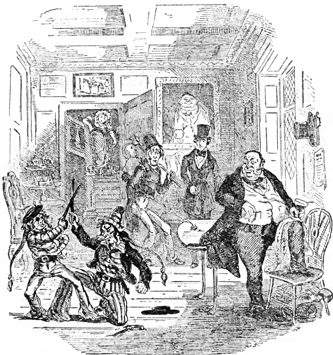
THE COUNTRY MANAGER REHEARSES A COMBAT.