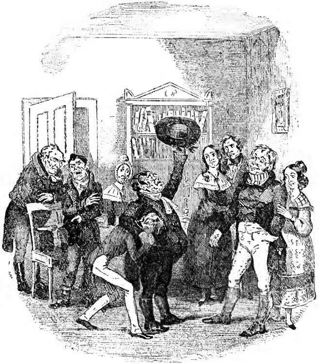
MR. SNAWLEY ENLARGES ON PARENTAL INSTINCT.