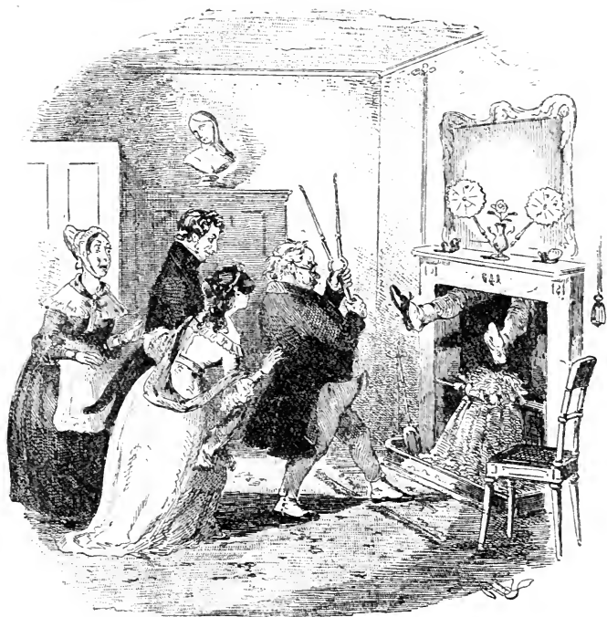
MYSTERIOUS APPEARANCE OF THE GENTLEMAN IN THE SMALL-CLOTHES.