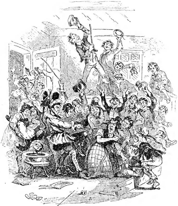
THE "BREAKING UP" AT DOTHEBOYS HALL.