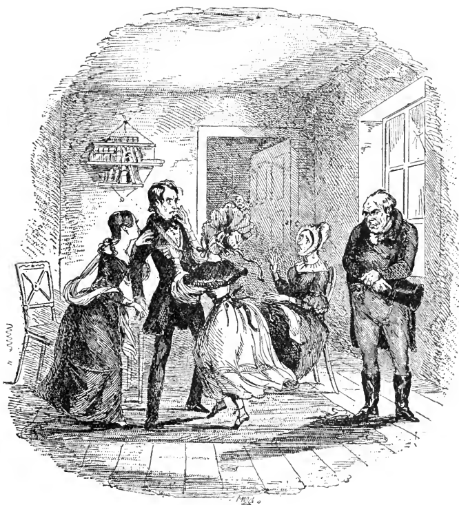
RALPH NICKLEBY'S HONEST COMPOSURE.