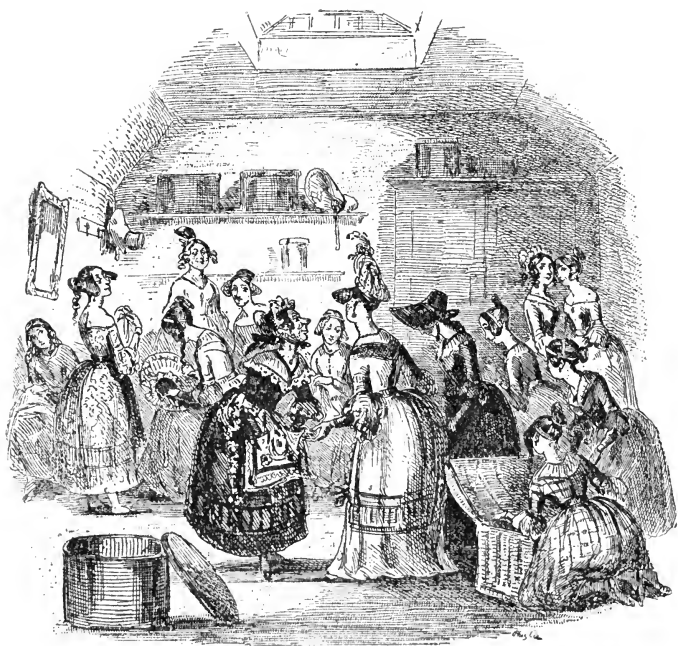
MADAME MANTALINI INTRODUCES KATE TO MISS KNAG.