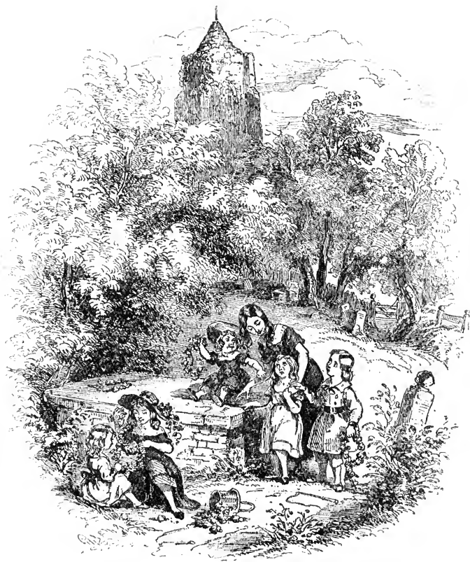
THE CHILDREN AT THEIR COUSIN'S GRAVE.