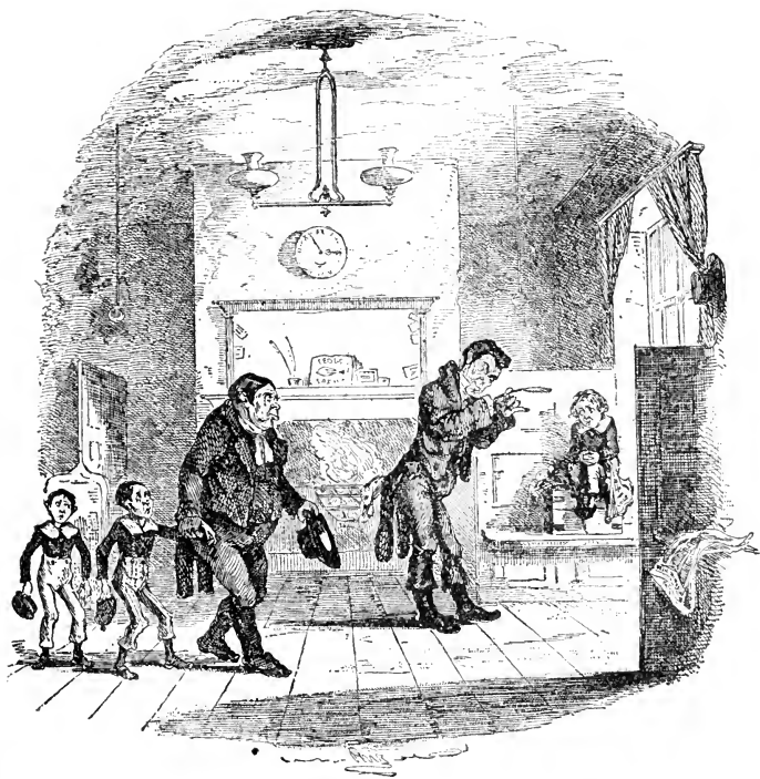
THE YORKSHIRE SCHOOLMASTER AT THE SARACEN'S HEAD.