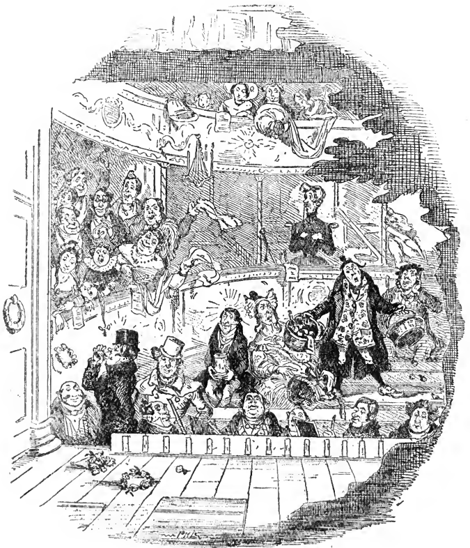
THE GREAT BESPEAK FOR MISS SNEVELLICCI.