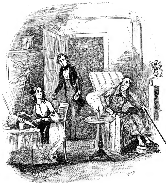
NICHOLAS MAKES HIS FIRST VISIT TO THE LODGINGS OF MR. BRAY