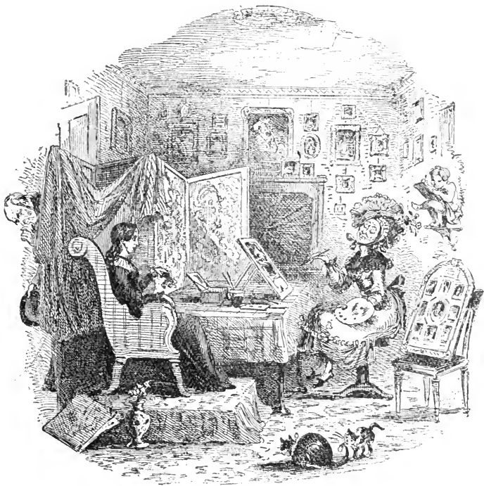
KATE NICKLEBY SITTING TO MISS LA GREEVY.