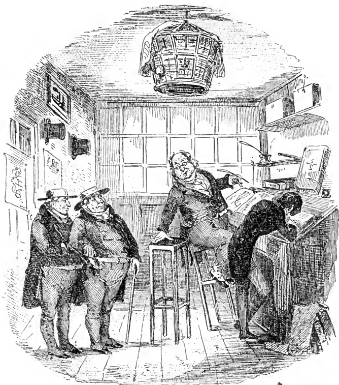
MR. LINKINWATER INTIMATES HIS APPROVAL OF NICHOLAS.