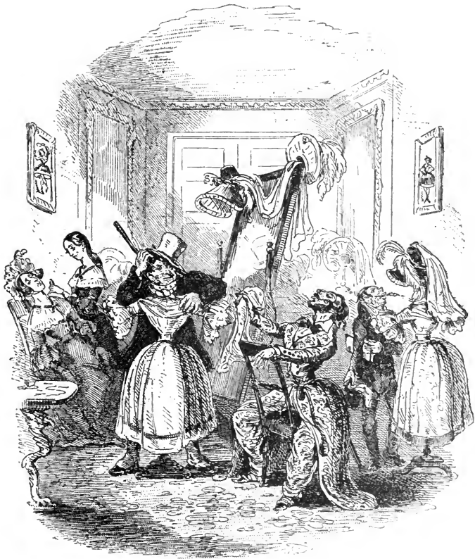
THE PROFESSIONAL GENTLEMEN AT MADAME MANTALINI'S.