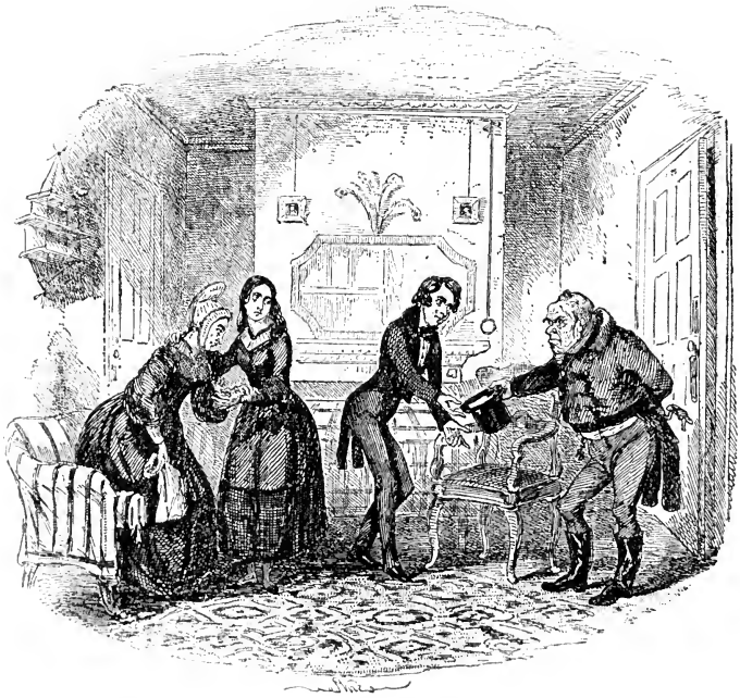
MR. RALPH NICKLEBY'S FIRST VISIT TO HIS POOR RELATIONS.