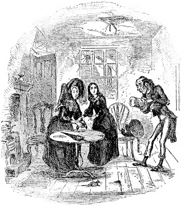
NEWMAN NOGGS LEAVES THE LADIES IN THE EMPTY HOUSE.