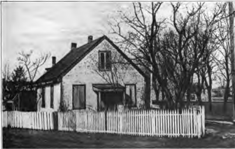
THE SCHOOLHOUSE AT BORDENTOWN