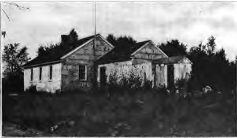
STONE SCHOOLHOUSE WHERE SHE FIRST TAUGHT