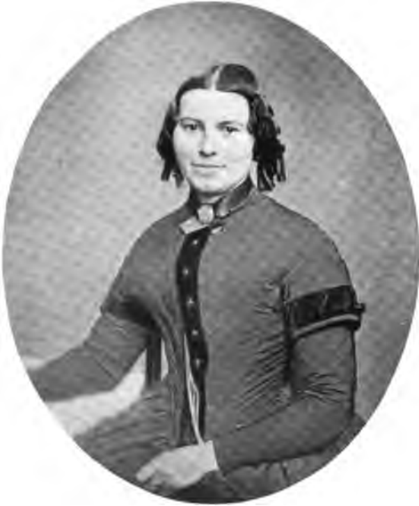
CLARA BARTON AT EIGHTEEN