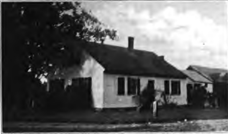
BIRTHPLACE OF CLARA BARTON