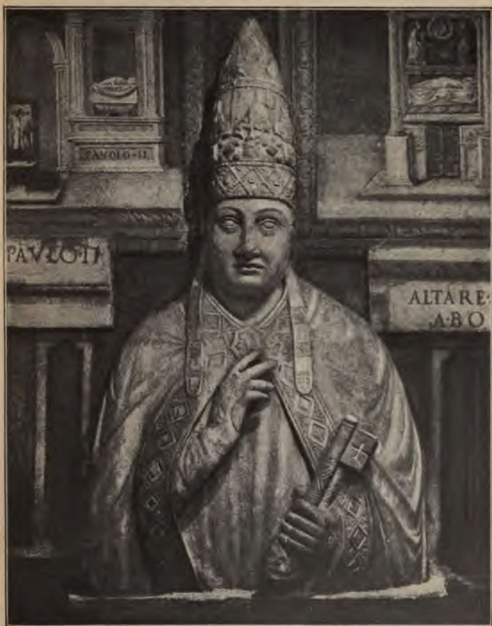
BONIFACE VIII By Arnolfo di Cambio