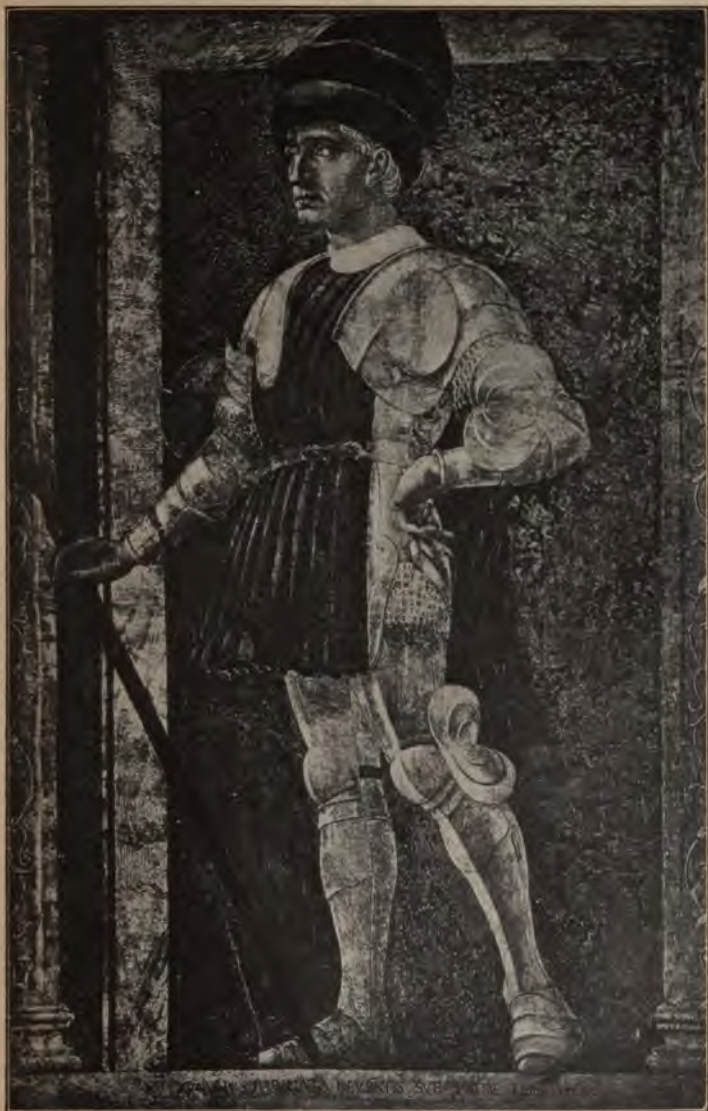
FARINATA DEGLI UBERTI From the painting by Andrea del Castagno.