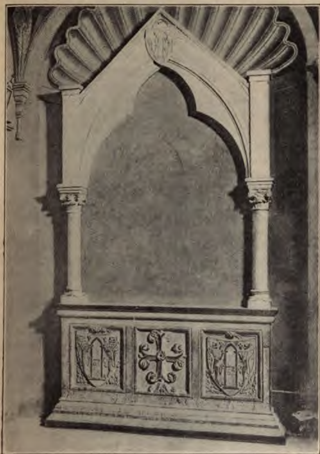
THE TOMB OF FOLCO PORTINARI