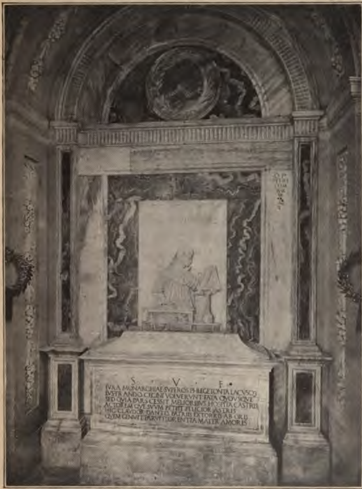
THE TOMB OF DANTE: INTERIOR