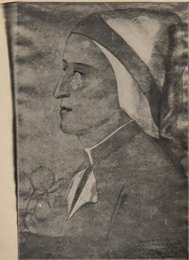
THE BARGELLO PORTRAIT OF DANTE