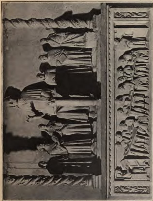
THE TOMB OF CINO DE' SINIBALDI AT PISTOLA

The relief shows him lecturing to his pupils