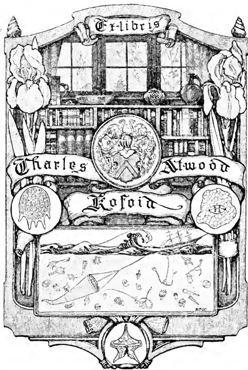
B.h. bookplate on back cover