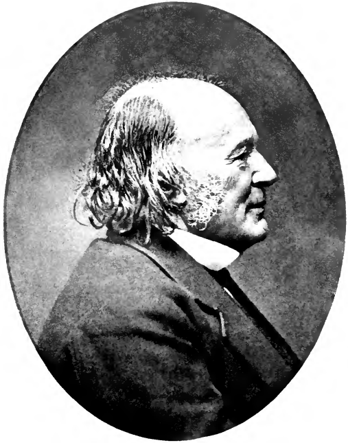
LOUIS AGASSIZ 1872