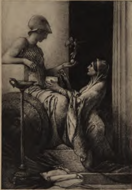
LELAND • STANFORD • JUNIOR • UNIVERSITY