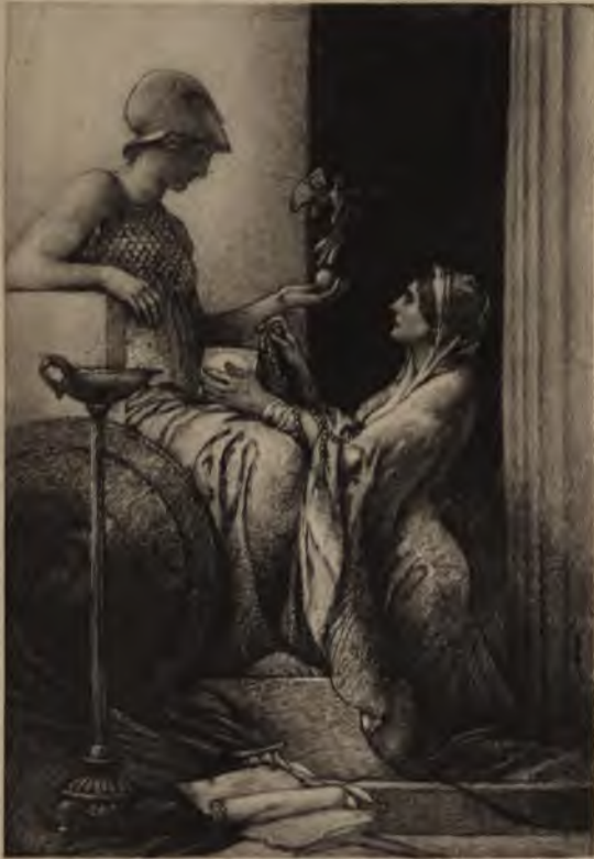
LELAND • STANFORD • JUNIOR • UNIVERSITY