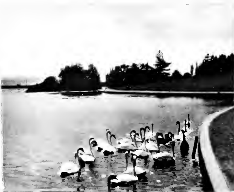
Swans in Poole Park.

A HISTORY OF EIGHTEENTH-CENTURY LITERATURE. 1889.