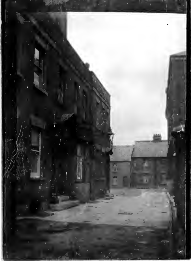
No 1 Skinner Street Poole Where Philip Gosse lived. THE LIFE OF