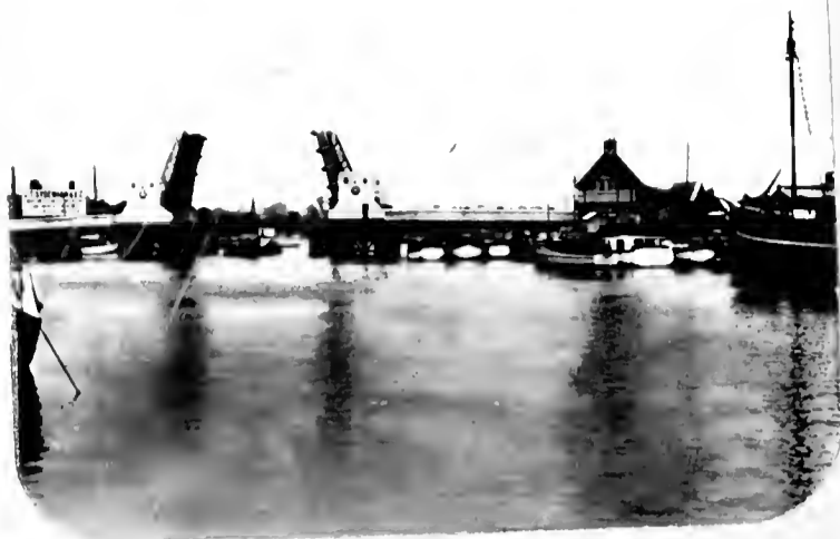
Hamworthy Bridge (Open), Poole.