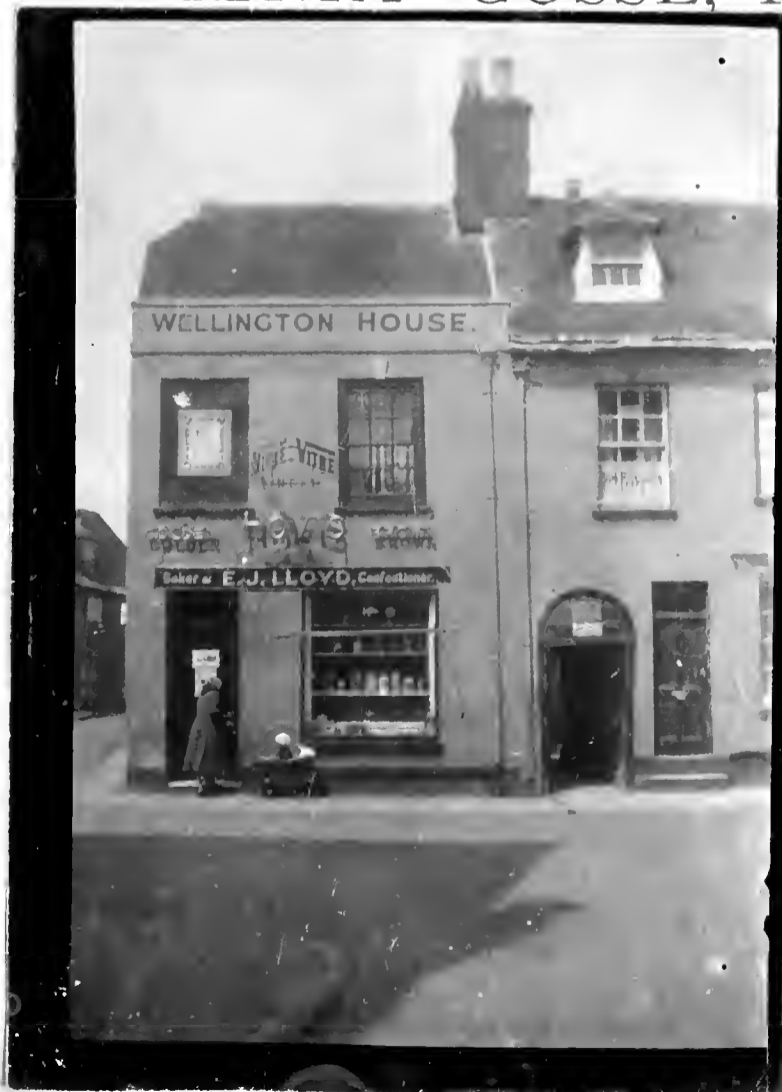
Notice the plaque in the upper blank window space saying that Thomas Bell F.R.S., the eminent Zoologist lived there!