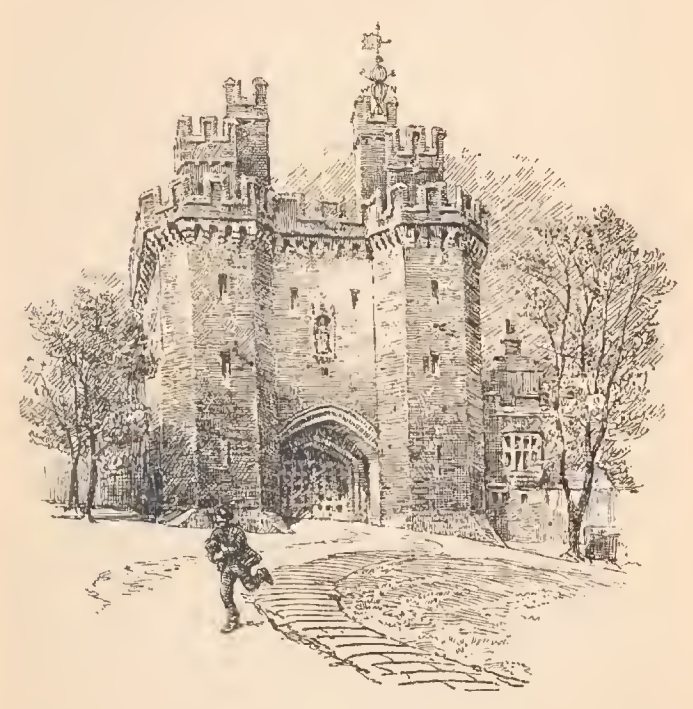
THE GATEWAY, LANCASTER CASTLE

'It happened during the probationary period