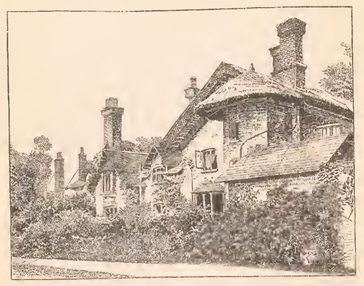
SHEEN LODGE, RICHMOND PARK Back view, as seen from Professor Owen's garden

strains, I stole down into the garden. Day was grayly dawning in the north-east, and some light clouds floating across a pearly sky. The nightingales were sending forth interrupted capricious carols from every bush; with a higher treble for some unknown warblers, and a lower one for