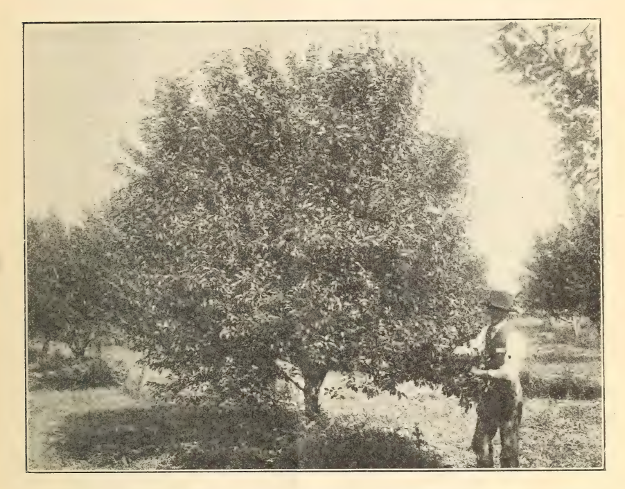
Fig. 2.—Montmorency cherry tree sprayed with self-boiled lime-sulphur mixture for the control of leaf-spot, showing full foliage. This tree stood in the same orchard and was photographed on the same date as that shown in figure 1.

Examinations made in August and September revealed very little change in the condition of the various plots. The trees of plots 1, 5, and 6 held a full crop of foliage throughout the season,<sup>a</sup> and very little, if any, difference could be observed in these plots. The self-boiled lime-sulphur mixture (10–10–50), the factory-boiled lime-sulphur solution (1–40), and the Bordeaux mixture (2–4–50) were equally effective in controlling the cherry leaf-spot. The trees in plot 2, which were sprayed with the weak (6–6–50) self-boiled lime-sulphur mixture, held up almost as well, but the mixture was evidently rather too weak for the best results. Most of the check trees