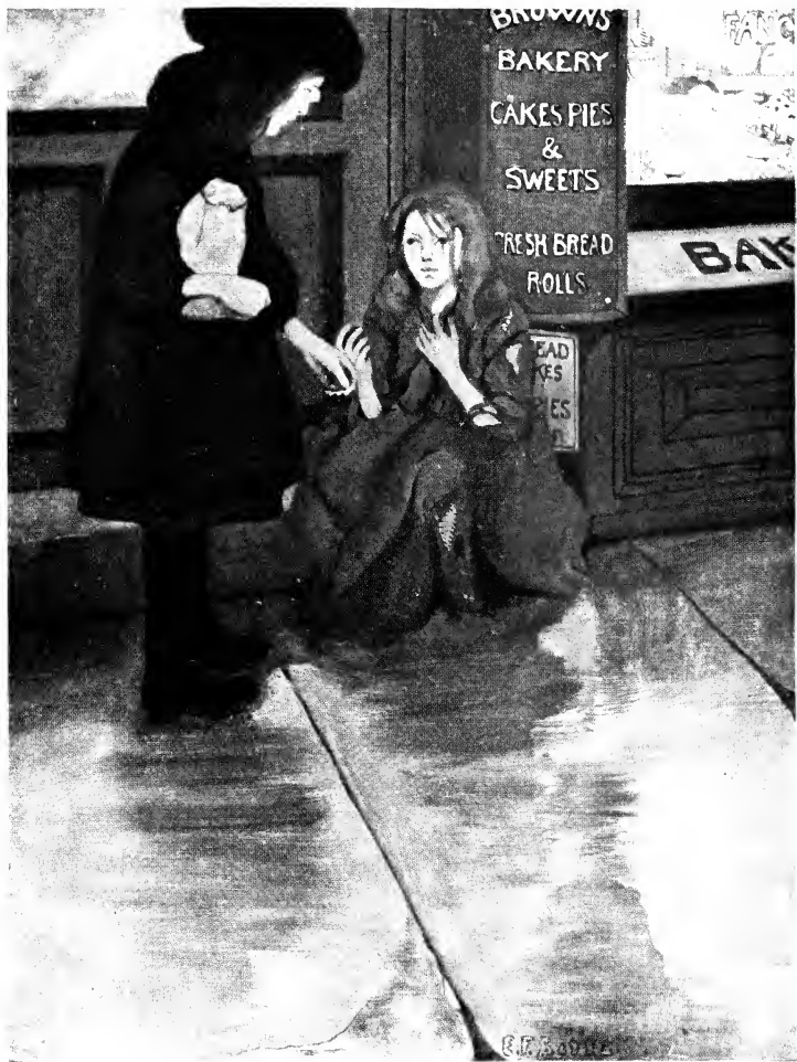
The beggar girl was still huddled up in the corner.