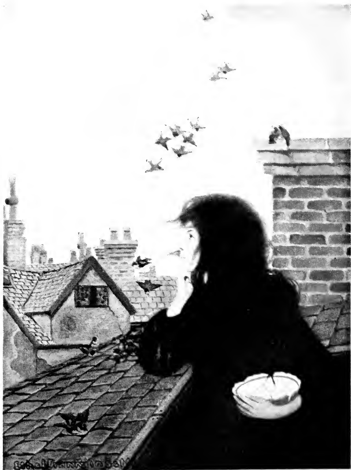
The sparrows twittered and hopped about quite without fear.