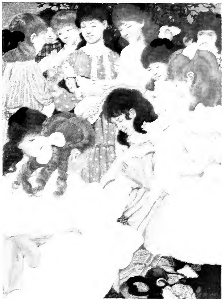
The children crowded clamoring around her.