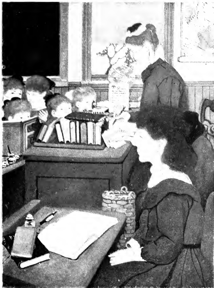
She was not abashed at all by the many pairs of eyes watching her