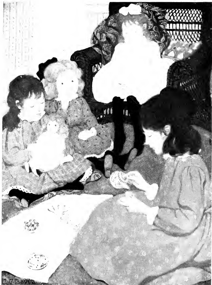
More than once she had been known to have a tea-party . . .