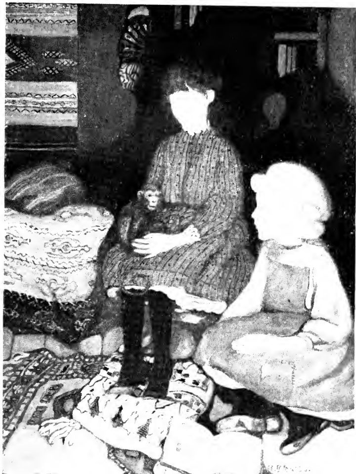
She sat down and held him on her knee.