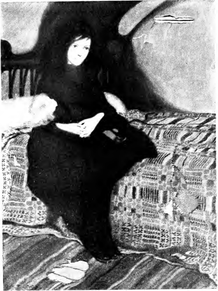
She seldom cried. She did not cry now