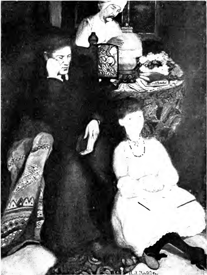
Noticed that his companion . . . sat gazing into the fire.