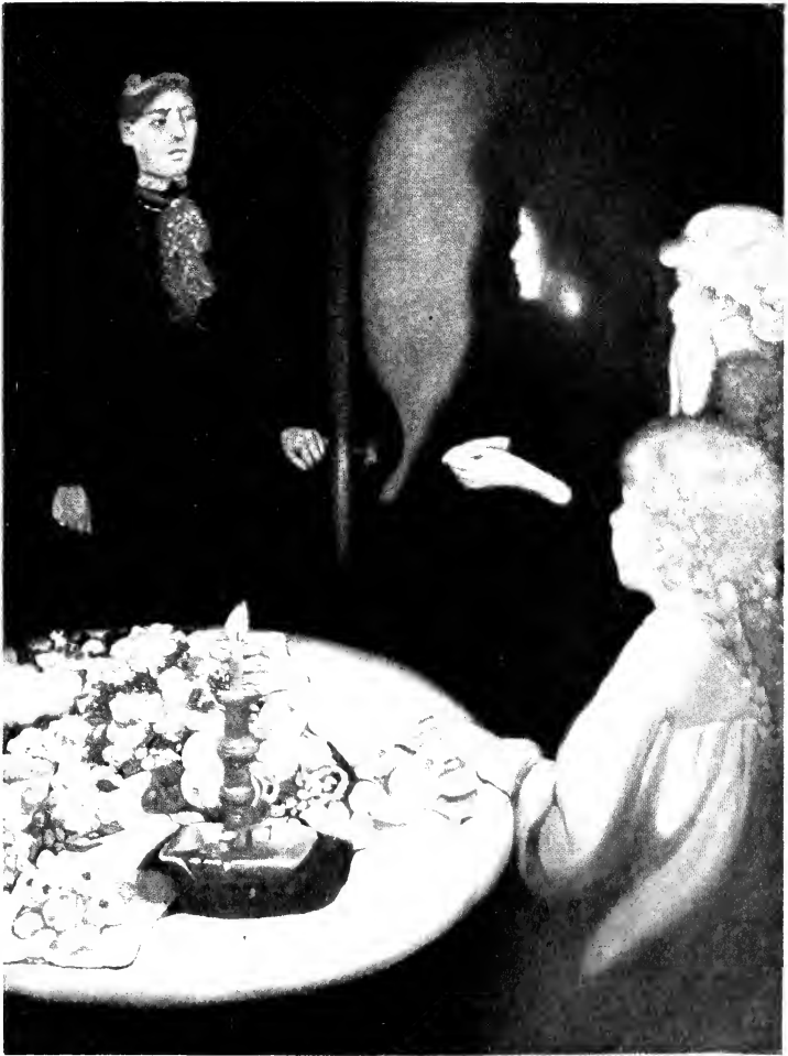
Miss Minchin struck the door open with a blow of her hand.