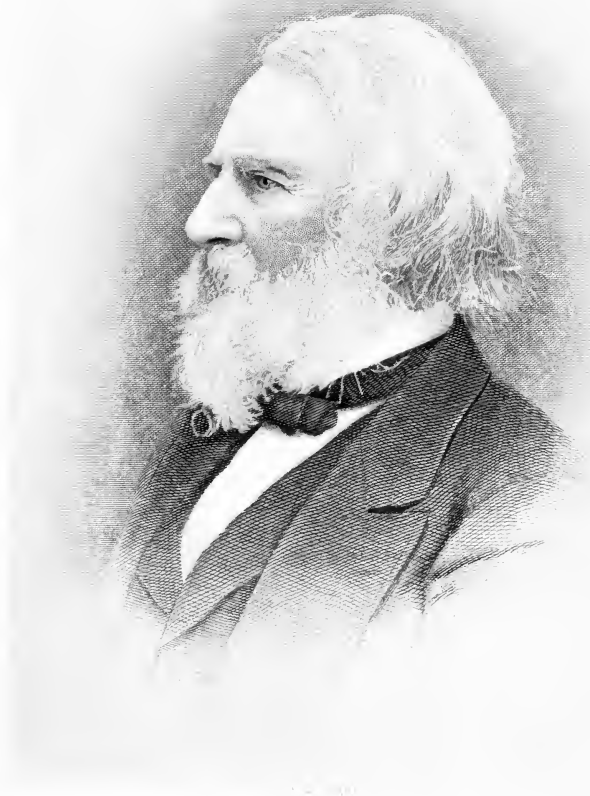
Henry W. Longfellow