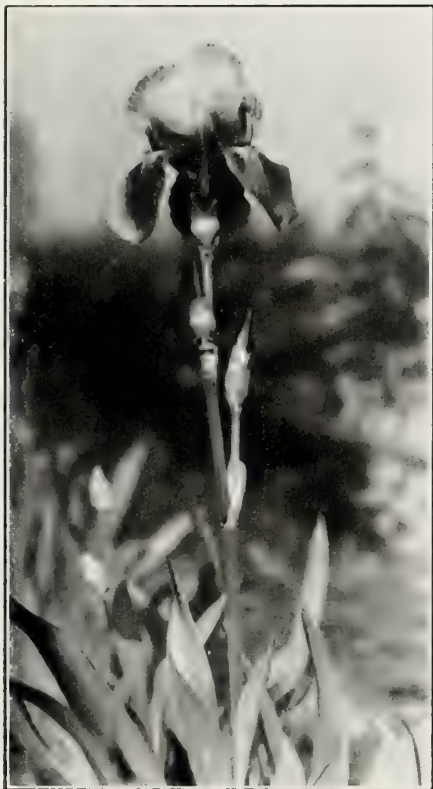
Lent A. Williamson

Mixed seedlings can be furnished only when we are digging our seedling beds soon after flowering in June. These seedlings