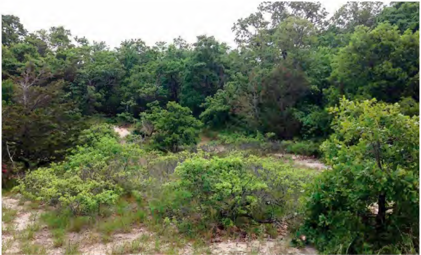
Figure 2. Continuous blackjack oak low forest at center of picture. Morella (Myrica) pensylvanica shrubs and Deschampsia flexuosa grass at center foreground; Juniperus virginiana shrub at extreme left, center; Quercus marilandica x Q. ilicifolia hybrid ( Q. x brittonii ) shrub at extreme right.