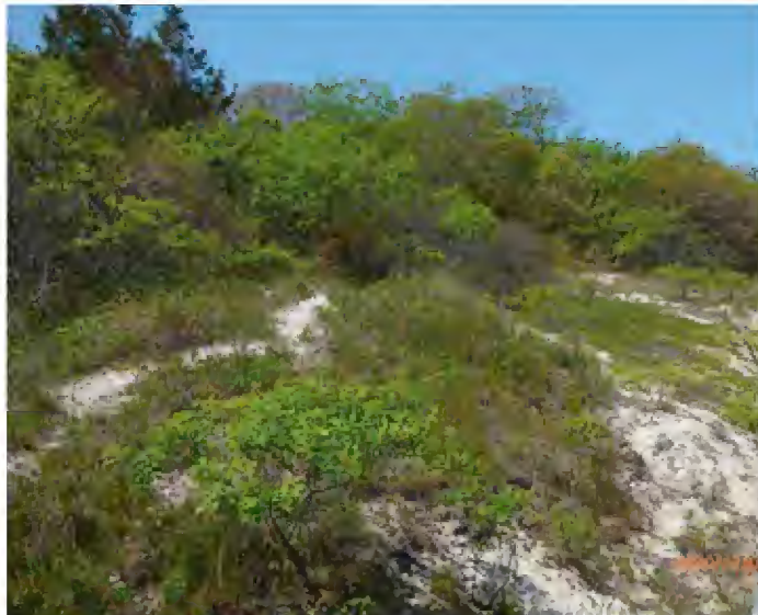
Figure 1. Habitat of blackjack oak low forest at Sunken Meadow State Park. Quercus marilandica and other oaks form a continuous stand; Prunus serotina shrub (front, center); Juniperus virginiana (tall, left rear); Arctostaphylos uva-ursi mat (center right), on bare sand. [Photo by A. Greller, May 20, 2016]

The forest is dominated by oak species, especially Quercus marilandica , the blackjack oak, which ranges in size from 3 to 5m tall (Fig. 2, 3). Other oaks seen here are: Quercus stellata , Q. ilicifolia , Q. coccinea , Q. velutina and a number of hybrids. [Ed. Note: Common names for species referenced here may be found in Table 1.] Among the hybrids Quercus x brittonii ( Q. marilandica x Q. ilicifolia ), is especially common. Other Quercus species encountered were Q. phellos and Q. palustris . These appear to be escapes from local cultivation. The tallest trees are specimens of Quercus velutina , Prunus serotina and Sassafras albidum . These grow at the crest and on the lee side of the dune ridge. Other trees observed are Betula populifolia , Amelanchier laevis and Juniperus virginiana . Robinia pseudoacacia and Ailanthus altissima are observed in areas where native trees were removed, near the western end of the boardwalk.