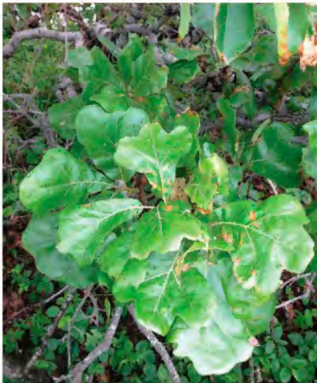
Figure 3. Quercus marilandica , showing leaves, in blackjack oak low forest.

rotundifolia . Lonicera japonica occurs in human-disturbed, open areas. Shrubs occur in the woodland and also dominate the vegetation in open places. Especially common shrubs are Morella (Myrica) pensylvanica and Prunus maritima . Amelanchier laevis is also common and grows to small-tree size. These shrubs are often found with vines that form the ground cover under them. A few herbs are seen in the forest: Polygonatum biflorum , Maianthemum stellatum , and M. canadense are prominent, with a few species of moss growing beneath them (Fig. 4). In areas devoid of shrubs and trees are found grassland stands of Deschampsia flexuosa . Also found with Deschampsia is Arctostaphylos uva-ursi , which can form a dense groundcover; also Rosa virginiana and R. rugosa (in bare sand); scattered Nuttallanthus (Linaria) canadensis occur here as well. Occasionally, in open portions of the dunes, one finds plants typical of sandy shores such as Solidago sempervirens and Ammophila breviligulata .