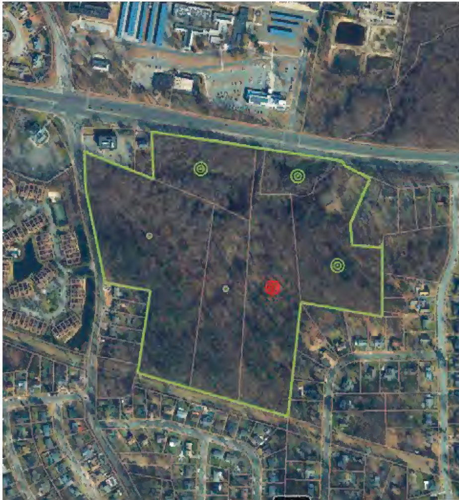
Figure 1. Aerial view of the Hauppauge Springs area (2016).

The open space project area is outlined in green and is bounded by Veterans Memorial Highway and Suffolk County Police Department 4 th Precinct Offices to the north. The two properties with small dots are owned by the Town of Smithtown. The property with the large green dot at the eastern boundary was acquired by Suffolk County two years ago. The two properties with the large green dots along the highway to the north are the County's most recent acquisitions. The easternmost of these two properties contains a stand of Atlantic white cedar, visible from the highway. The property with the red dot is the remaining privately-owned parcel that the County is in contract to buy and should close on in the next couple of months. [Screenshot from Suffolk County GIS Viewer, accessed 9/21/17.]