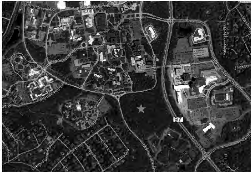
Figure 1. Location of study sites on the Stony Brook University campus. The yellow five-pointed star identifies the Ashley Schiff Park Preserve, location of soil-pH and leaf-collection sampling. The four-pointed star is the location of cation exchange capacity (CEC) analysis of soil.

Wherry (1923) studied the plant distributions and the pH of soil in a deciduous forest in Locust Valley some 40 km west of the Stony Brook University campus. This forest is