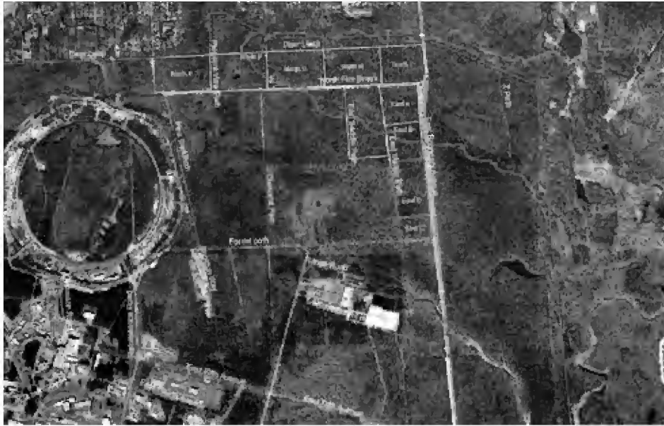
Figure 1. General aerial view of the Brookhaven Lab field trip area