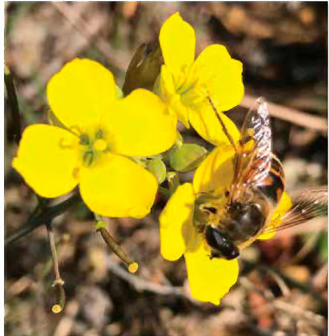
Figure 2. Sand rocket ( Diplotaxis muralis ) from Towd Point, Southampton Township, with mature flowers and developing fruits (siliques). The insect visitor, identified by Daniel Gilrein as a female drone fly ( Eristalis tenax ), was introduced from Europe around 1875 and is a mimic of the European honey bee ( Apis mellifera ). This type of mimicry is called Batesian mimicry because the mimic (not dangerous to predators) benefits because most predators avoid bees and wasps because they can inject toxins by stinging, so predators also avoid drone flies that are mistaken for bees and wasps.

Rare plant in New York (state rank: S2S3). In June 2019, Vicki Bustamante found a population of C. hormathodes in a marsh on the west edge of Oyster Pond behind the dunes of Block Island Sound, Montauk State Park, Suffolk Co. [voucher: 9 June 2019, V. Bustamante 1512 (NY)]. Species growing with C. hormathodes at this site include blue flag ( Iris versicolor ), common winterberry ( Ilex verticillata ), sallow sedge ( Carex lurida ), woolly sedge ( C. pellita ), common soft rush ( Juncus effusus ssp. solutus ), and swamp rose mallow ( Hibiscus moscheutos subsp. moscheutos ). Carex hormathodes occurs in brackish marshes and other maritime areas on rocks and sand often within reach of salt spray. There are 20 known populations of marsh straw sedge in New York and more than 20