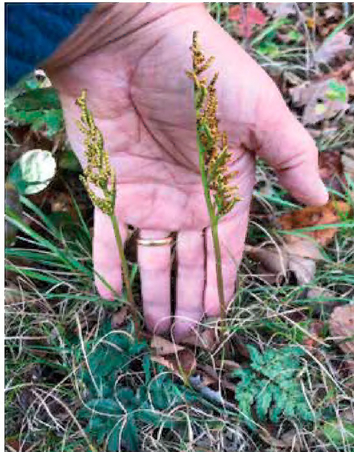
Figure 1. Blunt-lobed grape fern ( Botrychium oneidense ) at Montauk, Long Island. Photo by Vicki Bustamante, 2020.

New record for Long Island. For the past 100 years, this non-native annual grass from southeastern Asia has been spreading throughout eastern USA where it is invasive. Within three to five years it can form dense monotypic stands that crowd out and eliminate native, herbaceous vegetation. Arthraxon hispidus was reported from Bronx Co., New York as early as 1950 (Fernald 1950) and in 1990 it was still known in New