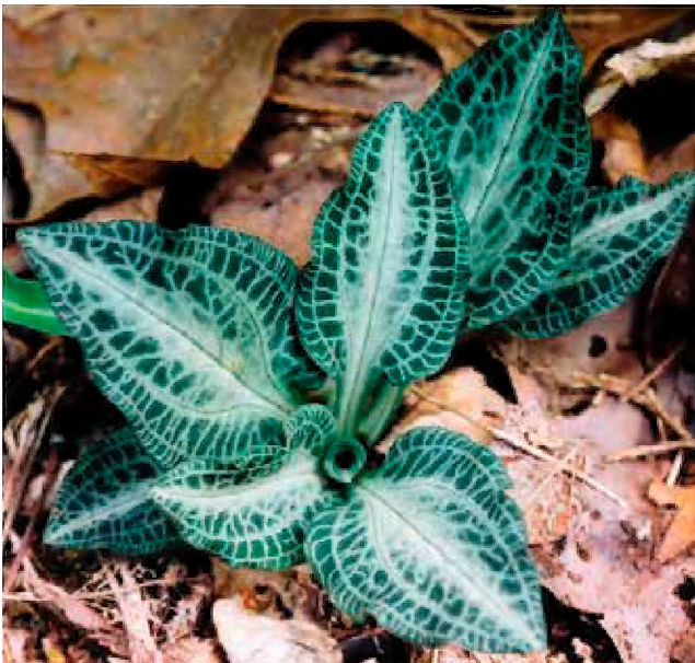
Figure 3. Basal leaves of downy rattlesnake plantain ( Goodyera pubescens). The attractively reticulated, evergreen leaves of this orchid are a visual treat in any season.