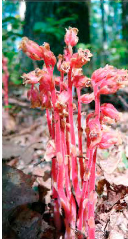
Figure 4. Red pinesap ( Hypopitys lanuginosa ). Pinesaps are mycotrophs, receiving nutrients via fungal mycelia rather than through photosynthesis. Image from Gob Botany ( gobotany.nativeplanttrust.org ).

Juncus scirpoides var. scirpoides , sedge rush (Cyperaceae the Sedge Family). Native.