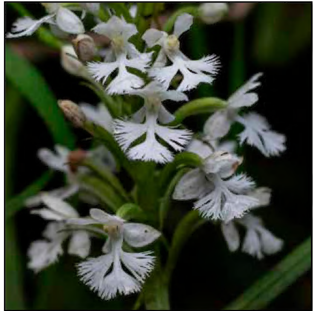
Figure 2. Within a colony of Platanthera psycodes one is likely to encounter flowers of every shade of color from white (forma albiflora , above) to bi-colored, to deep purple.

After thoroughly documenting this new population through photography (to rule out the similar-looking P. grandiflora and hybrid Platanthera taxa), I revisited the site once more on July 14, this time with Dave Taft. The main purpose of this visit was, in part, to get an understanding of the size of this new population. After over two hours of searching, we came up with an impressive 186 individuals: 94 flowering plants (or attempting to flower) and 92 sterile leaves. Also of note were at least two individuals with flowers that were entirely white; an uncommon color morph known as Platanthera psycodes forma albiflora (Brown and Folsom 1997, Fig. 2).