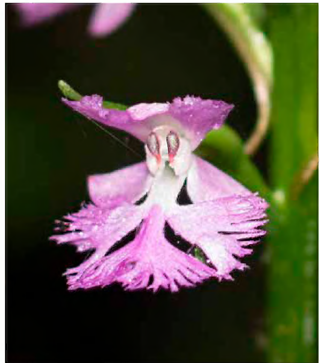
Figure 1. Lesser purple fringed orchid ( Platanthera psycodes ) from Smithtown, Suffolk County, NY. Left: inflorescence; right: close-up of a flower, note the two ripe pollen sacs (pollinia) at the base of the lip.

On April 22, 2023, I spent my morning looking for goldenclub ( Orontium aquaticum ) in the Town of Smithtown, Suffolk County. In my pursuits, I traipsed into an obscure, unnamed wetland within the headwaters of the Nissequogue River. There, a convergence of numerous groundwater seeps trickle through an Acer and Nyssa -dominated swamp and feed the river. I did not find any goldenclub that day, but I did notice at least a dozen Platanthera orchids (I did not keep count) in early-spring growth, just emerging from the mossy edges of the water.