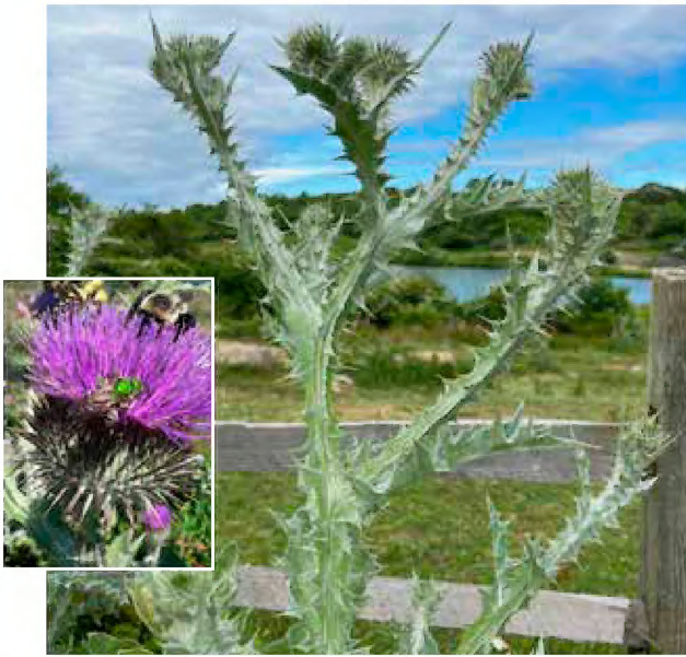
Figure 2. Onopordum acanthium subsp. acanthium (Scotch thistle) from Suffolk County, NY. Inflorescence, winged upper stem, and close-up of a flower (inset) with insect visitor.

(Noteworthy Plants, continued from page 25)