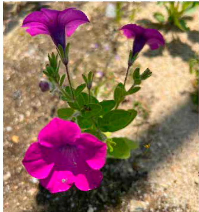
Figure 4. Petunia integrifolia (violet petunia) from Suffolk County, NY.

Petunia integrifolia , violet petunia (Solanaceae, the Potato Family). Non-native. (Fig. 4).