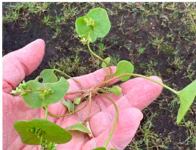
Figure 1. Claytonia perfoliata (miner's lettuce) from Suffolk County, NY.

New record for New York. Claytonia perfoliata is reported here as the first naturalized occurrence in New York; it has not previously been reported for the state (Miller and Chambers 2006, Werier 2017, Werier et al. 2023, USDA 2023). This spring, at an agricultural tree farm in eastern Southampton Township a small population (3 individuals) of C. perfoliata was discovered growing in a production area under some benches in a hoop house topped with mesh shade cloth and open sides to the elements. Voucher: New York, Suffolk Co., Southampton Township, growing at an agricultural tree farm, 18 May 2023, V. Bustamante 2097 (NY). This species, with its bizarre upper leaves, is native to western North America, Mexico, and Central America where it prefers shady, moist habitats. It is introduced in the eastern United States, South America, Europe, Asia, (continued on next page)