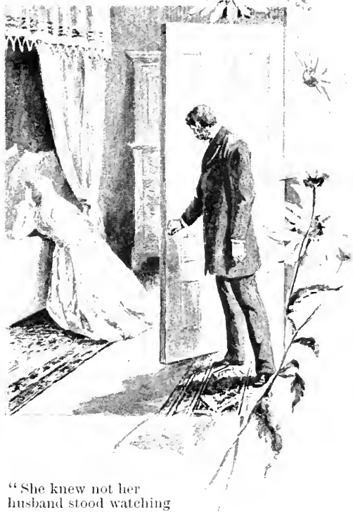
“She knew not her husband stood watching her.”