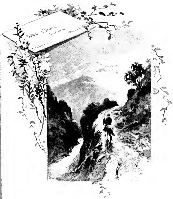
“In tracking a mountain abyss.”