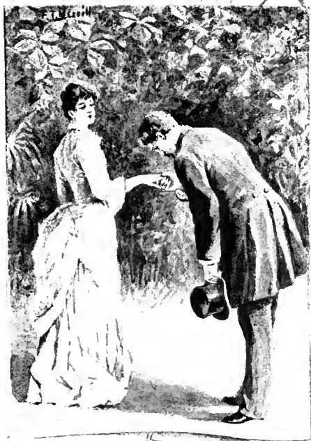
“The Duke bowed his lips o’er her hand.”