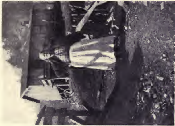
We thought Grandma Sprouse a salty old lady . . .