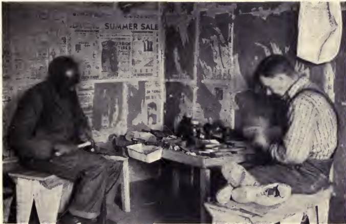
The result was not Bond Street, but it prevented chilblains.