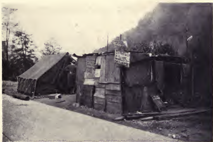
The operators, with nothing to lose from a labor shortage, began evictions. The refugees moved into tent colonies.