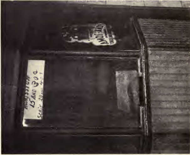
A dollar's worth of scrip brings an average of seventy-five cents in cash.