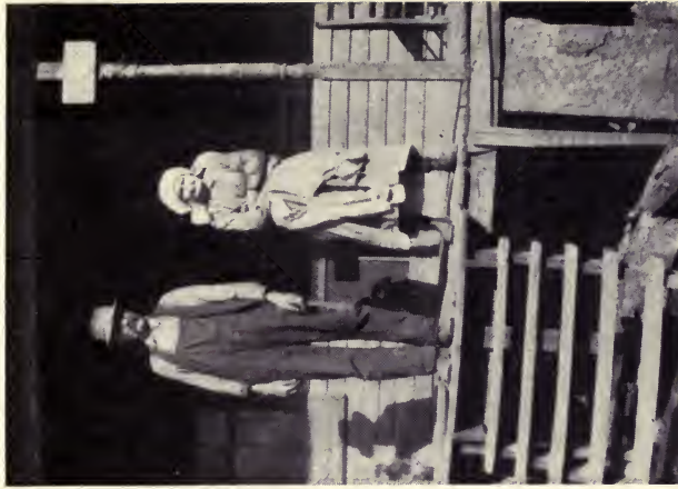
There is little that is amiable about their fallow decline . . .