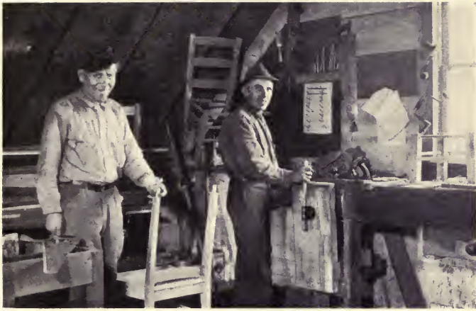
The Quakers proved that the people turn naturally to handicrafts.