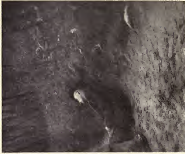
For twenty-five cents a man can get enough corn likker to make him sodden.