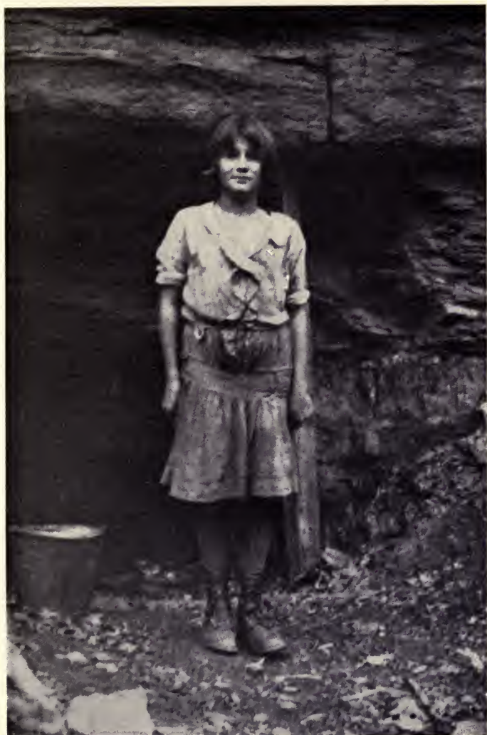
Soon they marry and begin to raise more miners . . .