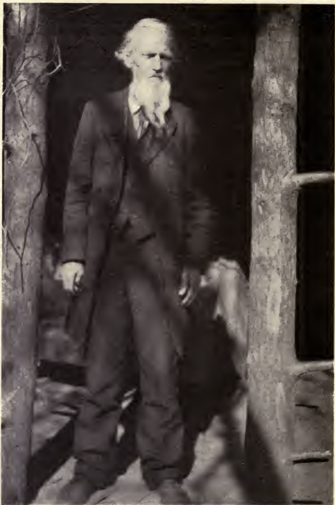
"They ran a concrete road through my hollow, and now I must live to see my grandchildren racing up and down in automobiles."