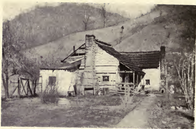
The log cabin had an air of being suited to the casual life.