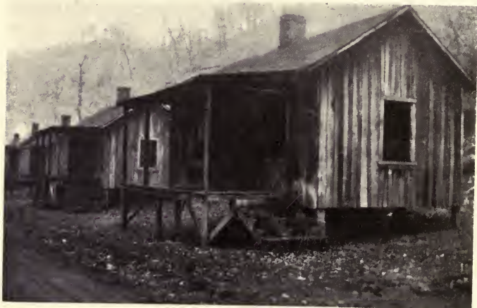
The barrenness of the miner's shack is that of stricken imagination.