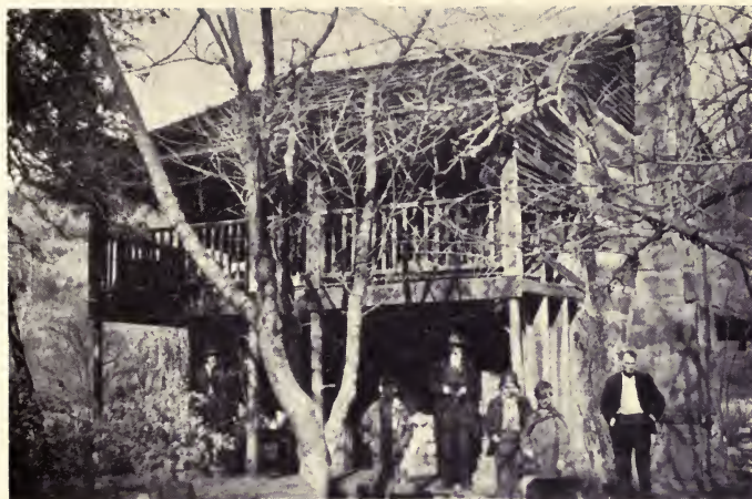
They still make their living from his 300 acres, seven of his children, with their children.