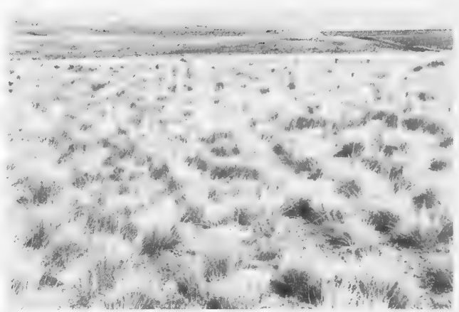
Bunchgrass range in EXCELLENT condition. At least 90 percent of the forage is provided by native perennial grasses. No weedy annual grasses or brush occur. There is a good understory of Sandberg bluegrass between the climax wheatgrasses and Idaho fescue. This range provides more than 1 animal-unit-month of grazing per acre under good management.

Management of grazing lands to improve and maintain forage production falls into three categories: forage-management practices, enabling practices, and facilitating or speedup practices.