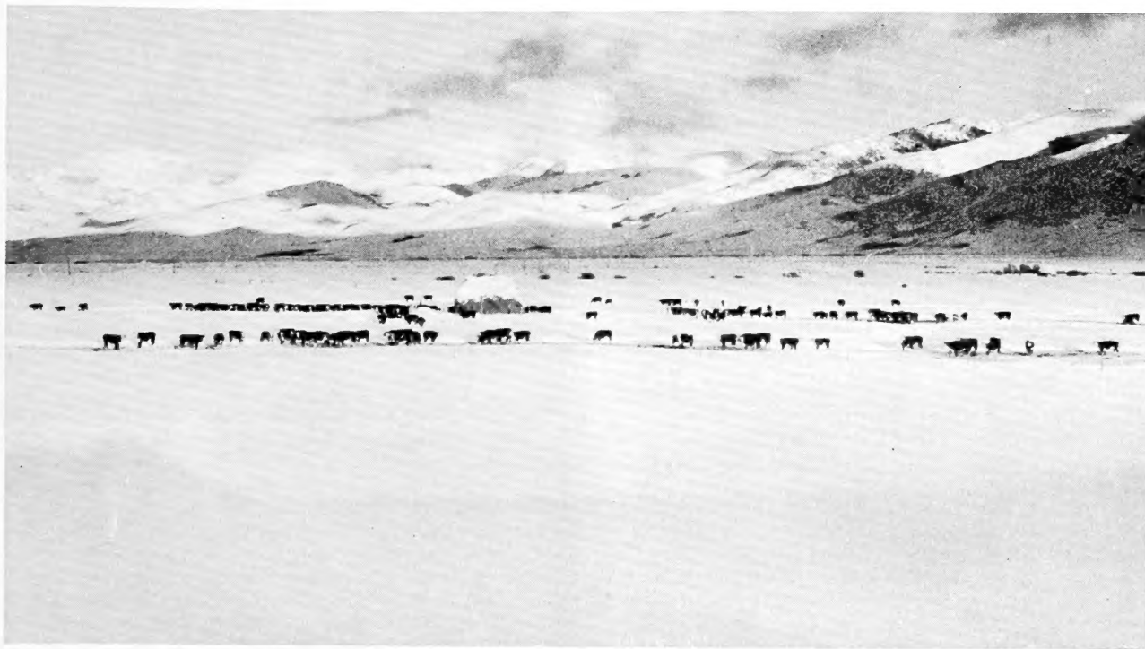
A good supply of hay aids management of range and pasture. (Lamoille Soil Conservation District, Nev.)

Skinner's (56) studies point out that about 10 percent of the hay crop is lost in harvesting, storing, and feeding. The part lost is the fraction that contributes most to the