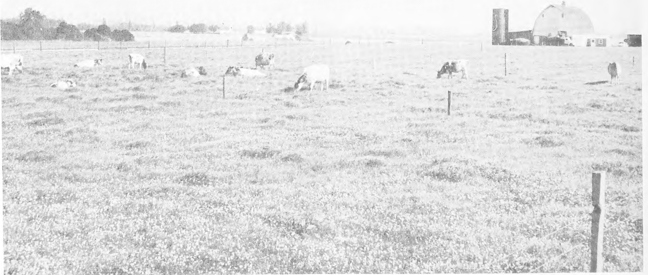
Electric fences divide this irrigated pasture into \frac{1}{2} -acre units. Orchardgrass, Alta fescue, and ladino clover are the grasses on the pasture. Such pastures can carry more than 3 high-producing dairy cows per acre. (Willamette Valley, Oreg.)

Grain crops are still used to establish pastures on irrigated land and in subhumid areas. This practice is responsible for poor establishment on