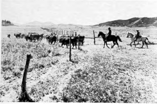
On this Idaho ranch herds are driven from one seeded dry-land pasture to another to provide rotation grazing.

many farms. Some research workers have used this method with success on good fertile soil with irrigation, but they have been careful to manage the water to favor the forage. Experience among farmers, generally, indicates that the grain crop usually receives major attention at the expense of the pasture seeding. A growing practice is to stubble-in the pasture seeding after the grain crop has been harvested. The seeding is made as early as possible after midsummer so the plants, especially the legumes, are well established before the irrigation water is turned off or before freezing weather sets in.