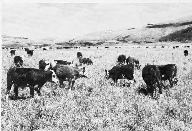
Supplemental dryland pastures make good grazing management easier. This Manchar brome-Tualatinoatgrass-alfalfa pasture carries a beef herd in late summer after the native range forage is no longer green. (Caribou Soil Conservation District, Idaho.)

The acreage of pasture in the West that is reported to be treated with N, P_2O_5 , and K_2O is