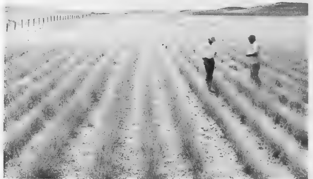
A seeding of Whitmar wheatgrass in Washington. This is the first of many seedings made on this ranch to convert 50,000 acres subject to wind erosion to grass.

The principal results of reseeding research and experience are: (1) That the reseeded area must fit into the grazing-management plan for the ranch or the range unit. Little advantage and possible harm to range condition came from seeding a small area within a large grazing unit to species quite unlike the native forages in season of use or quality. (2) That the better sites, especially with respect to soil, had the greatest potential for increasing grazing capacity of the range area and could best be fitted into the management plan. (3) That every possible effort should be made to prepare a good seedbed that allowed precision seeding. On arid lands and on rough topography, often with sandy or stony soils, this was no easy matter. Many special machines have been constructed and subjected to engineering research to make them suitable for