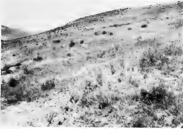
Range in POOR condition. Native perennial grasses make up less than 10 percent of the stand; 80 percent of the forage is weedy annual grass and 10 percent is forbs. About 6 to 8 acres are required to provide 1 animal-unit-month of grazing, and then only for a short time in the early spring. Such ranges should be reseeded.

The aim of range-forage management is to increase the density of desirable forage species and to decrease undesirable grasses, forbs, and shrubs.