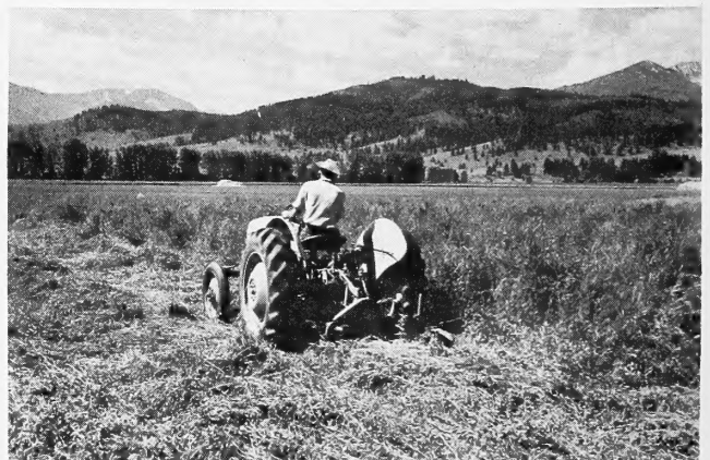
More than 5 tons of alfalfa-smooth brome hay were obtained from 2 cutting in this Oregon hayfield. Alfalfa-tame grass mixtures produce high yields, prevent bloat when fed, are free from weeds and weedy grasses, and are easy to cure and handle. (Baker Valley Soil Conservation District.)

Meadow hay was harvested in 1949 from more than 2,600,000 acres in the 11 Western States. Native grasses, legumes, sedges, rushes, and forbs are the plants on these meadows. Many meadows are irrigated, but the yield per acre is low and the quality of hay is often poor. There is