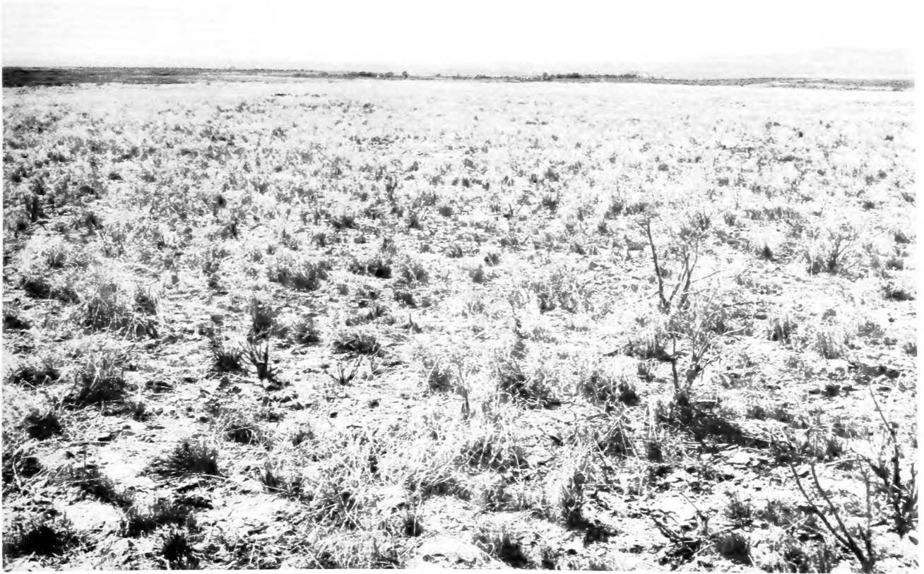
A good seeding of Whitmar wheatgrass on range from which sagebrush was removed by controlled burning. Such reseeded ranges when fitted into the grazing-management plan for the ranch can be the key to increased forage production. (Wood River Soil Conservation District, Idaho.)

land preparation and seeding. This advance has done much to reduce unit costs, to effectively remove competition, and to reduce the hazards to establishment imposed by limiting and erratic climatic conditions. (4) That a sizeable mass of information is at hand on what and when to seed. A vast number of common forage species and an even greater number of introductions have been tested under a wide variety of conditions. Reasonably good information is available on adaptation to climatic conditions. Some information has been obtained on adaptation to soils. Somewhat surprising has been the performance of native grasses, especially when several seasons of adverse climate were experienced. Information is badly needed on the response of many introductions and of planted native species to grazing under controlled management. This important field of research has hardly been touched.