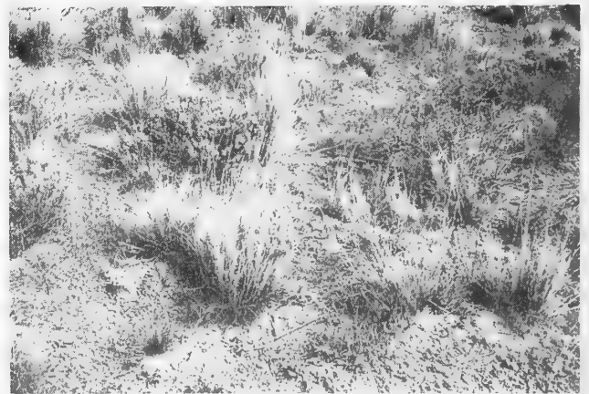
Range in FAIR condition. Only 80 percent of the forage is provided by native perennial grasses, understory grasses are absent, and weedy annual grasses and brush have invaded the stand. Such range provides about two-thirds animal-unit-month of grazing per acre. It can be improved with good grass management practices.

Range condition is based on plant succession and expresses the present state of the vegetation in relation to climax conditions for the site. The climax association is regarded as optimum in yield and quality. Range trend as determined by the existing vegetation indicates whether climax species, subclimax species, or invaders are increasing under existing management.