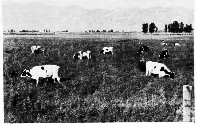
An intensive system of rotation grazing is followed on this well-managed Utah pasture. Alfalfa-grass mixtures produce high yields of good-quality pasture on good soils if they are properly irrigated and fertilized.

Pastures on cultivated land. --The pastures on cultivated land vary greatly in grazing capacity. The differences are due to climate, soil, and management. Highest production is obtained from irrigated pastures on good land, while unirrigated pastures in semiarid areas are usually low in production. Most of the pastures on cultivated land are rotation pastures and as such make valuable contributions to soil management in