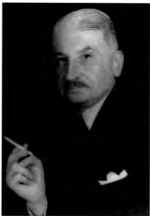
LUDWIG VON MISES