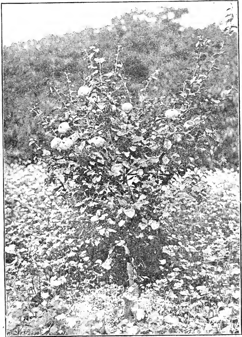
FIG. 1.—Young quince tree, just coming into bearing, showing few long shoots.

the shoots of the previous year's growth send out new shoots, and after these shoots have grown for a few inches (usually from 3 to 6) a single blossom is produced on the end of the shoot. This, of course, temporarily stops the growth in that direction, and if the blossom sets