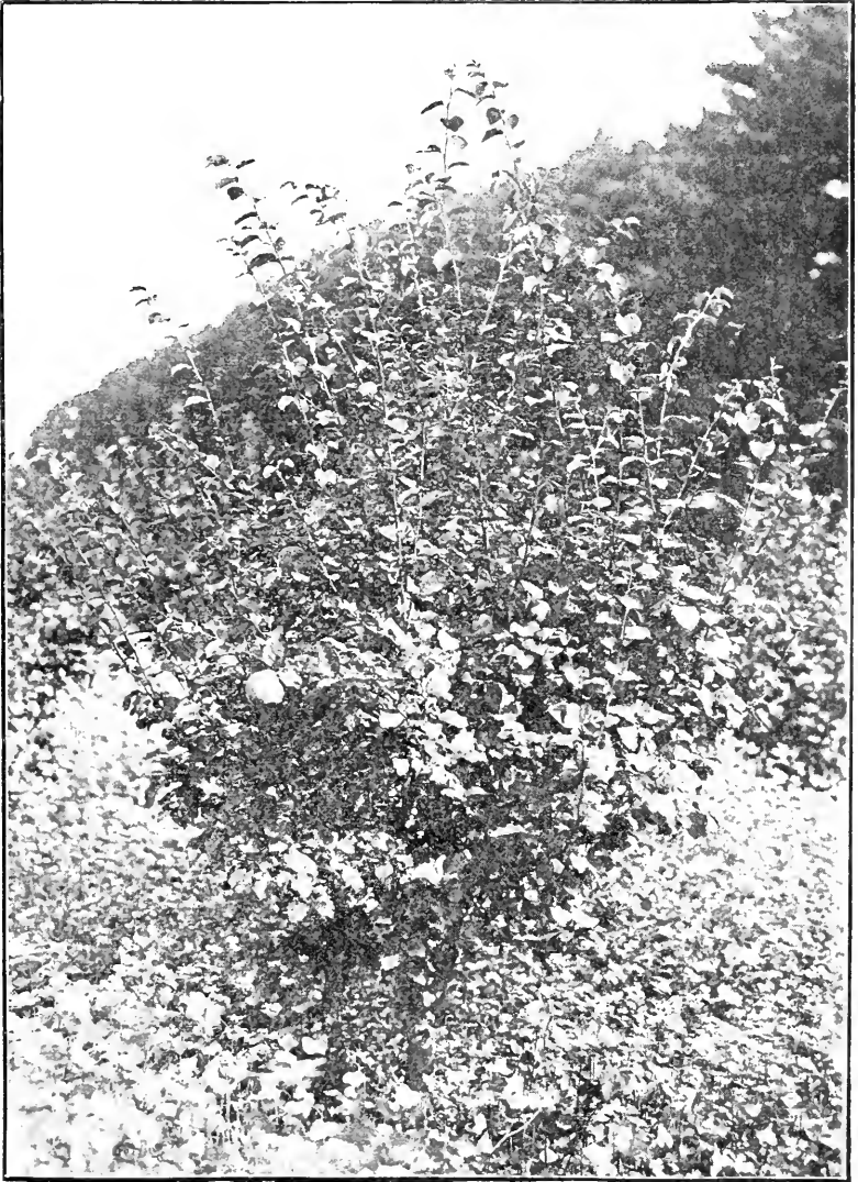
FIG. 2.— Young quince tree, not yet in bearing, showing long terminal shoots, which need heading in.

branch, sometimes for a foot or more. All this means that on those branches where a quince tree sets fruit its yearly growth is very slight indeed, and if it bears abundantly, the tree will present a rounded top, looking almost as though it had been sheared, as in the case of the